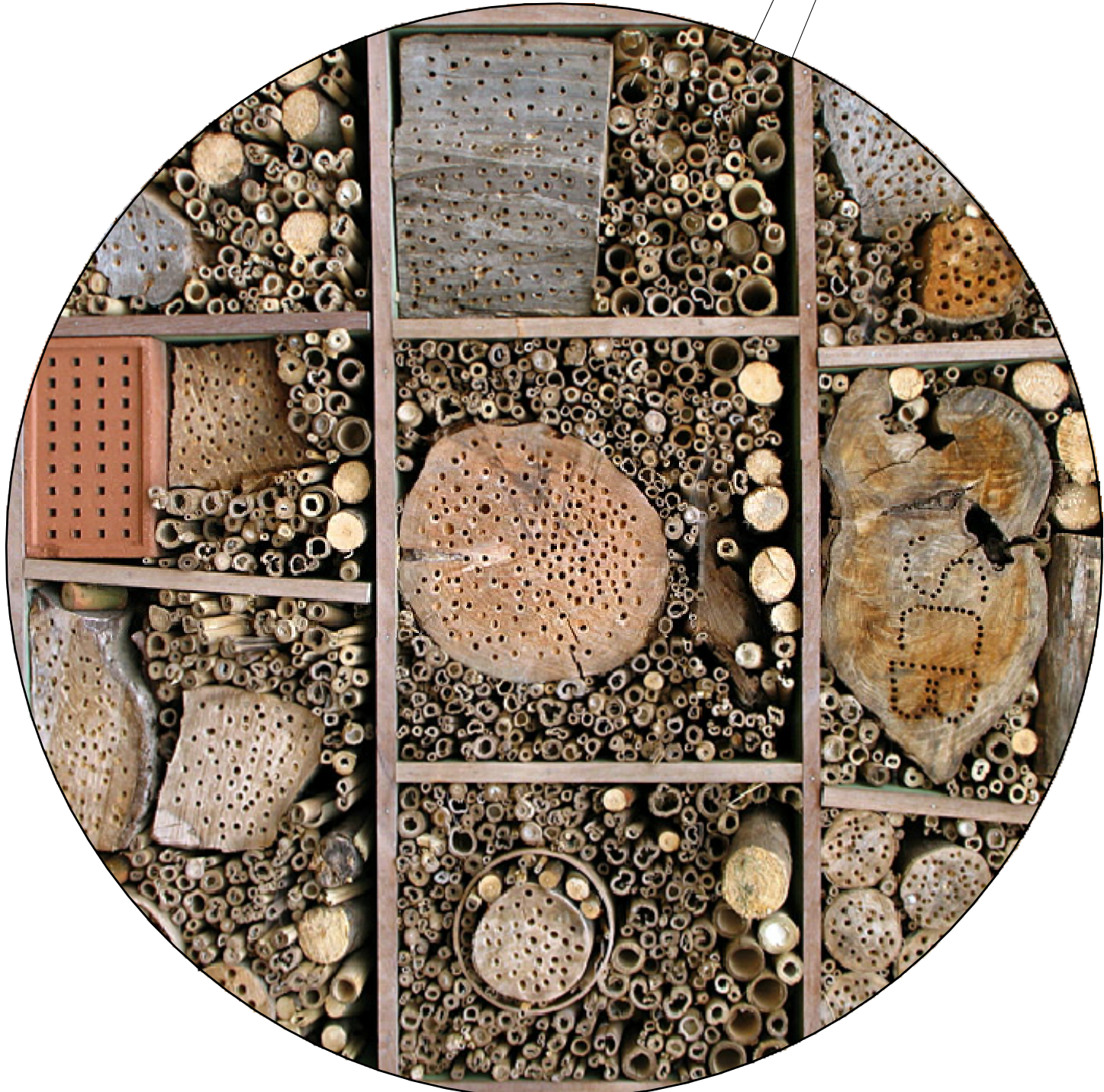
Indicative image to illustrate the appearance of habitat panels