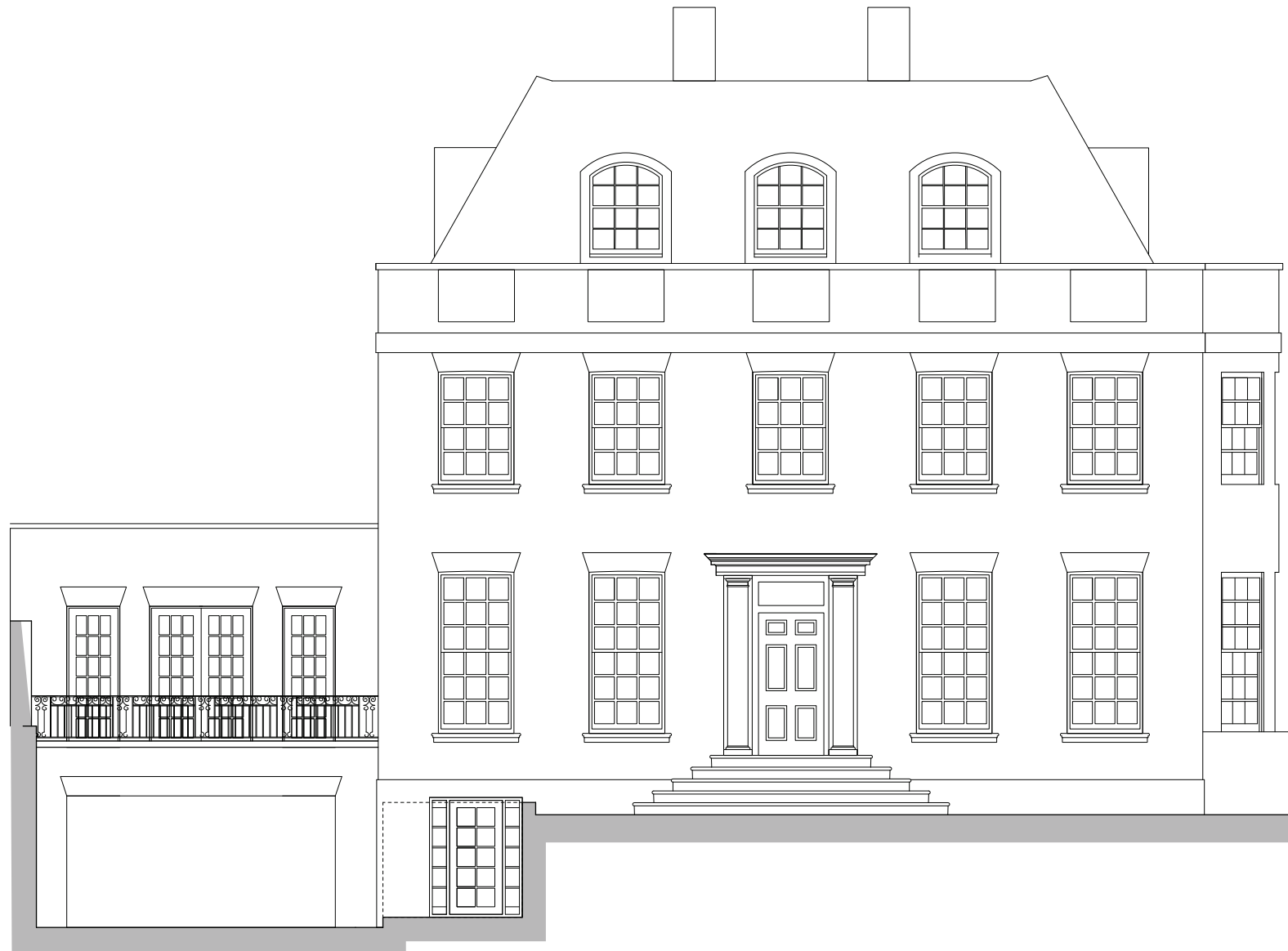
ELEVATION FACING ABBEY ROAD