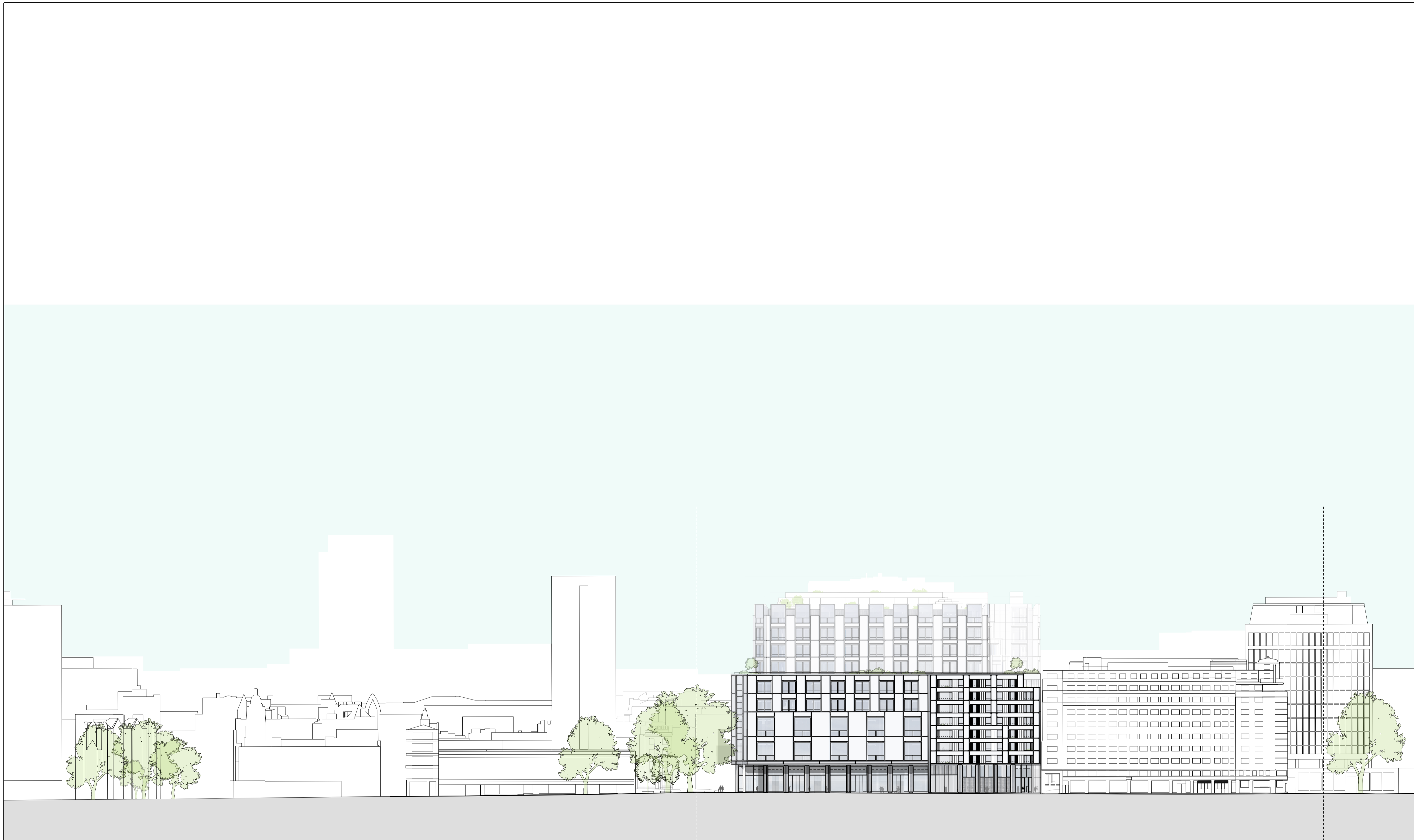
SITE CONTEXT - SOUTH ELEVATION