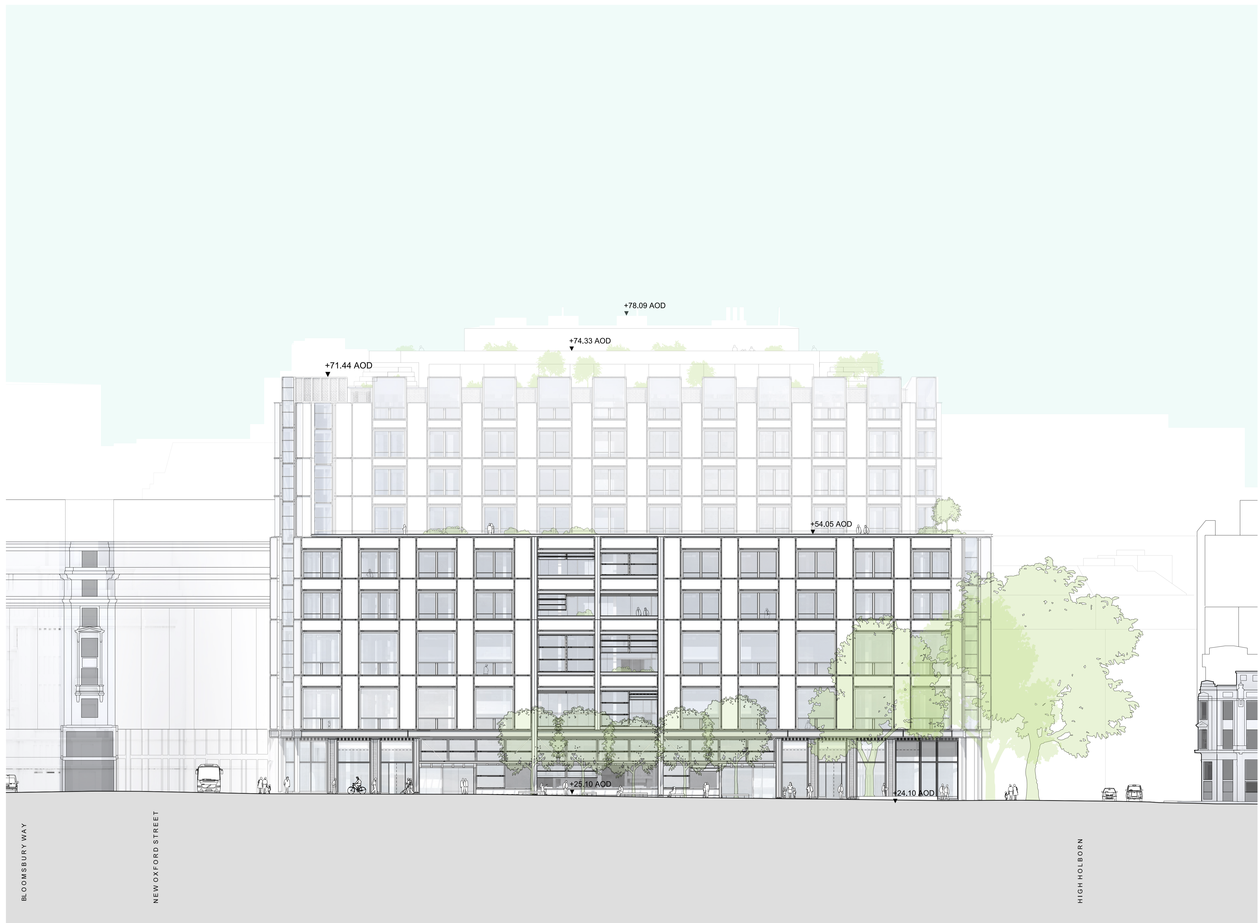
WEST ELEVATION - PROPOSED