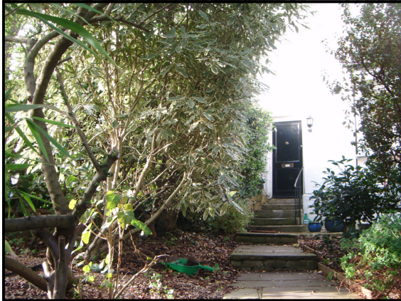
1. G1 Viburnum