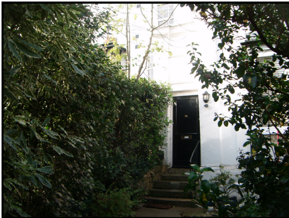
3. T1 Ash and G1 Viburnum