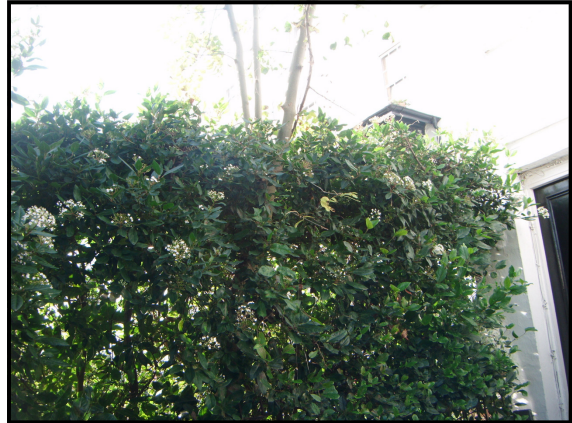
2. T1 Ash and G1 Viburnum