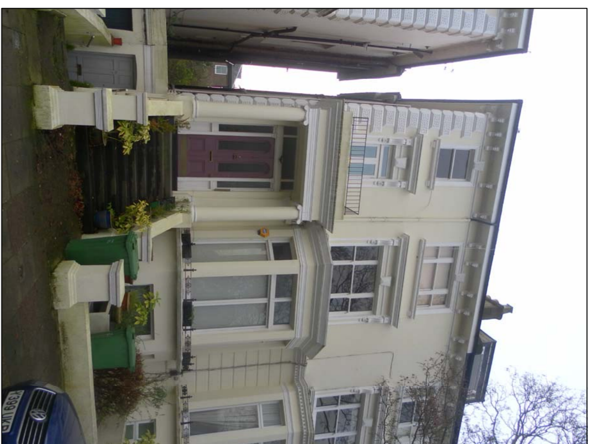
No. 6 BELSIZE SQUARE