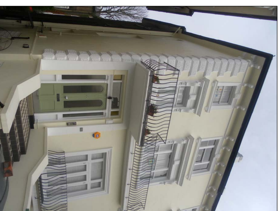
No. 40 BELSIZE SQUARE