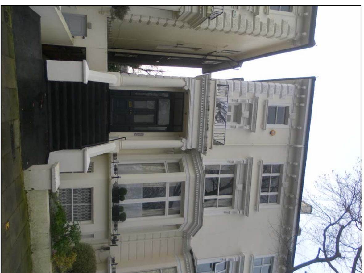
No. 8 BELSIZE SQUARE