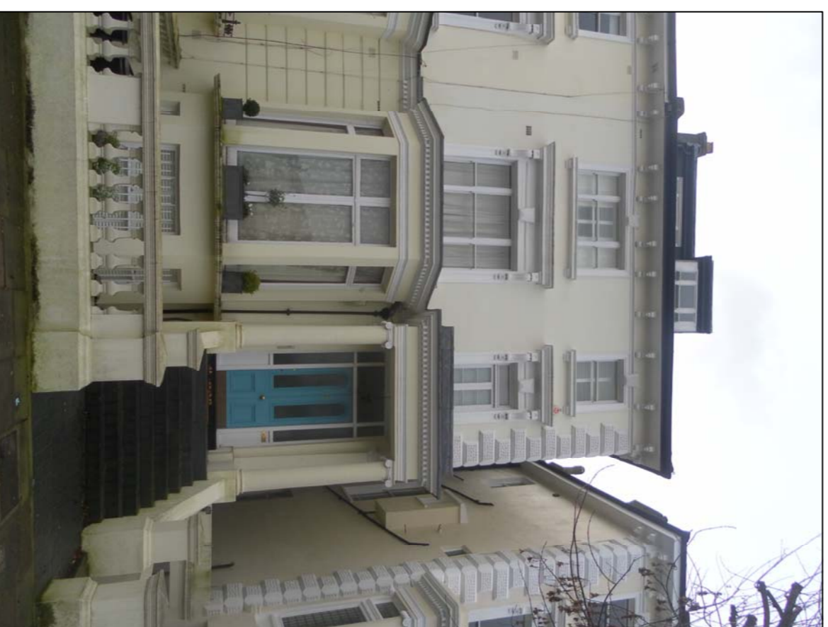
No. 13 BELSIZE SQUARE