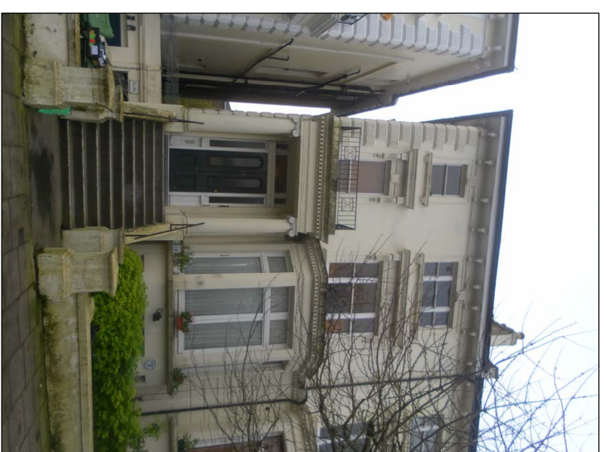
No. 10 BELSIZE SQUARE