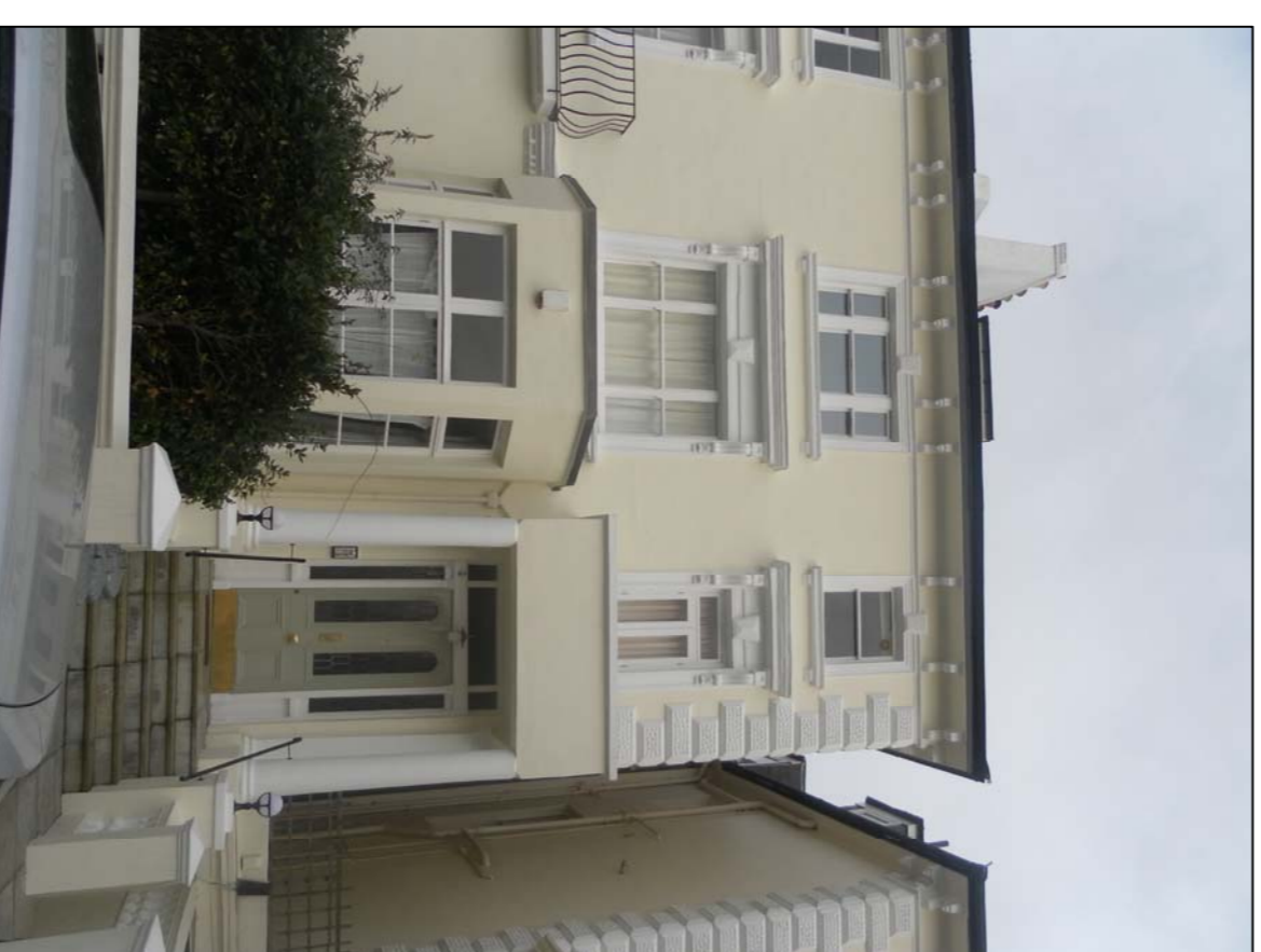
No. 39 BELSIZE SQUARE