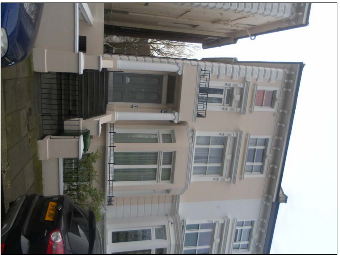
No. 2 BELSIZE SQUARE