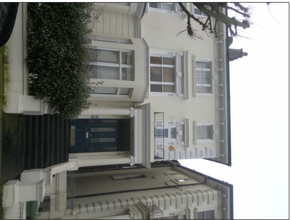
No. 11 BELSIZE SQUARE