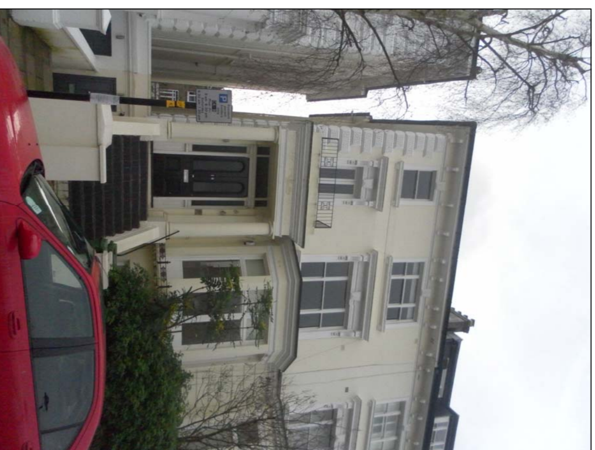
No. 14 BELSIZE SQUARE