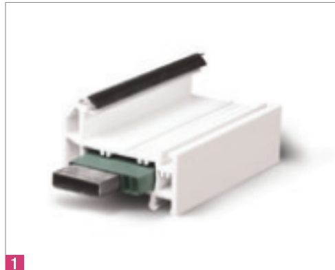
1 Patented Thermal Sleeve.