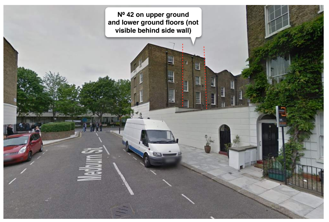
View along Medburn Street. No 42 Charrington street is entirely concealed from view.