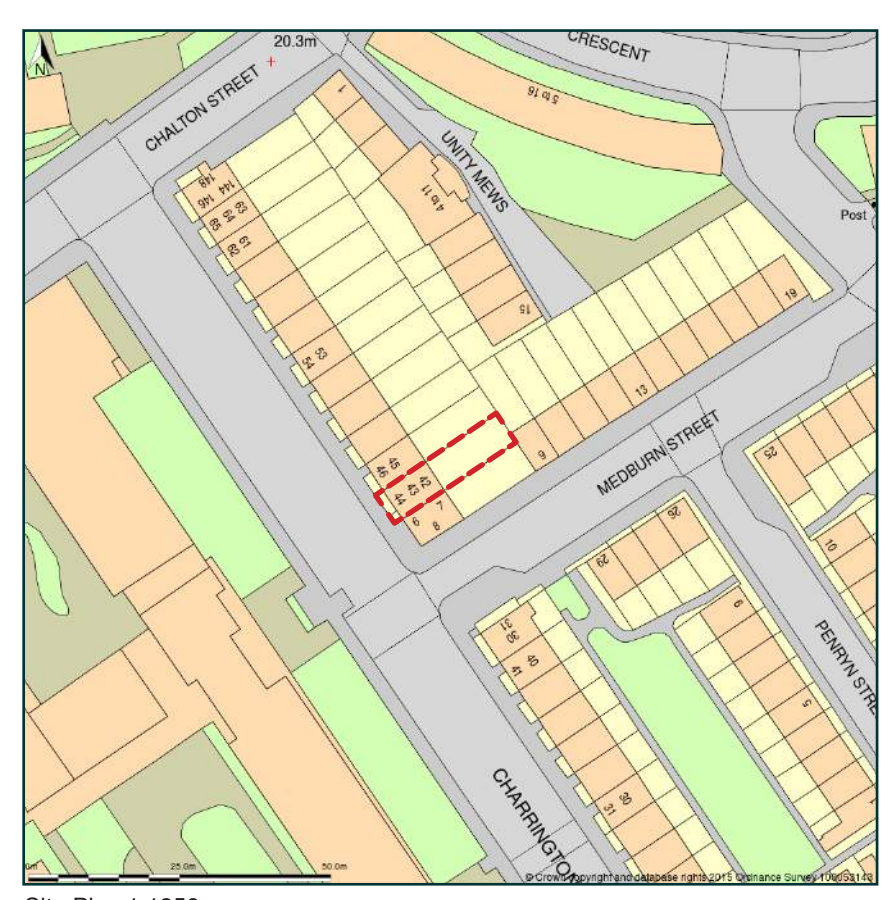
Site Plan 1:1250