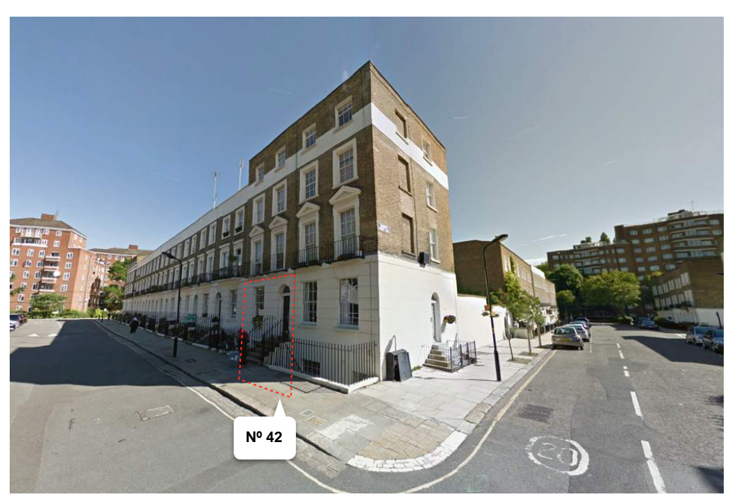
View of N° 42 Charrington Street from the corner with Medburn Street, looking North.