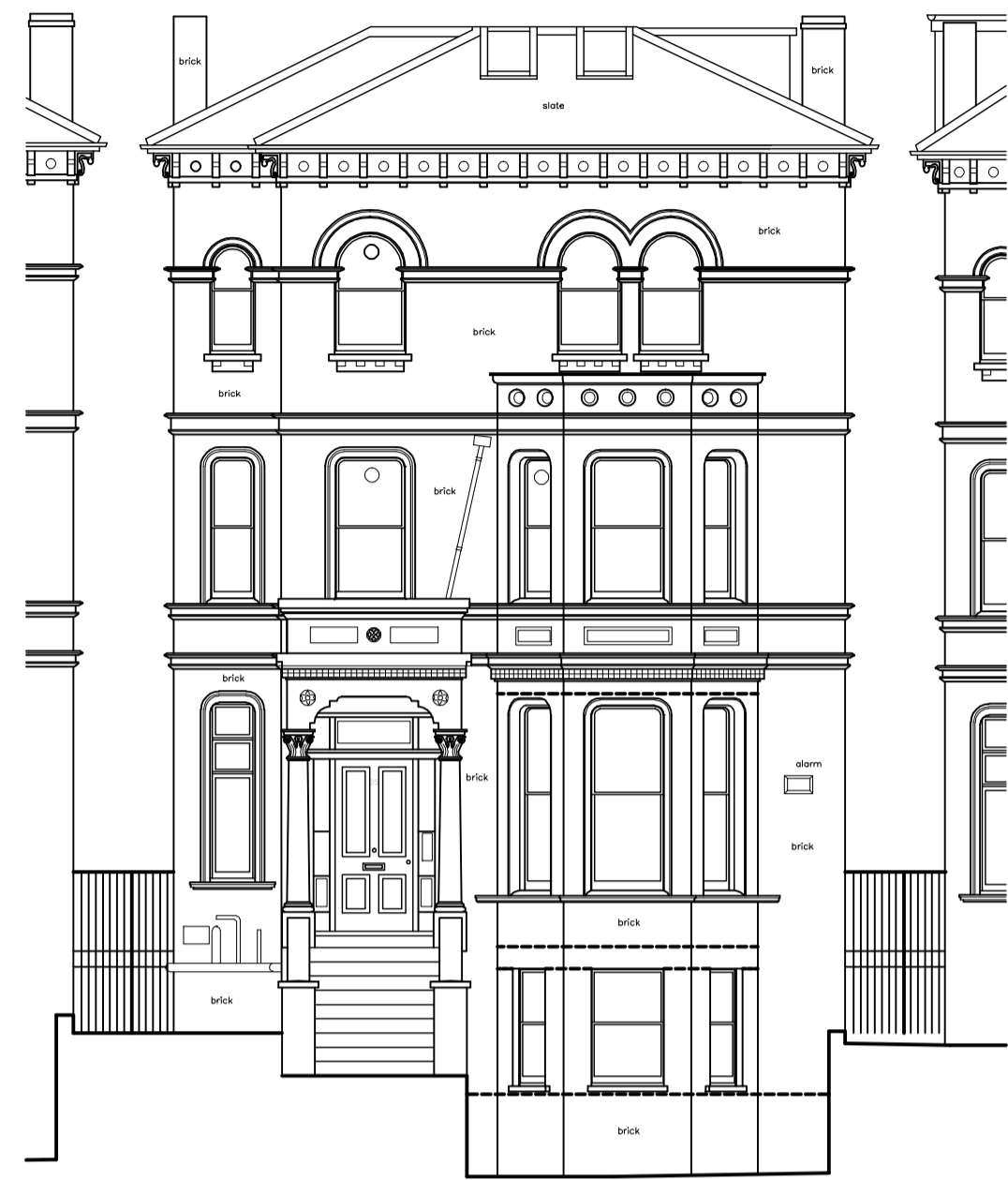
South Elevation (Lancaster Grove)