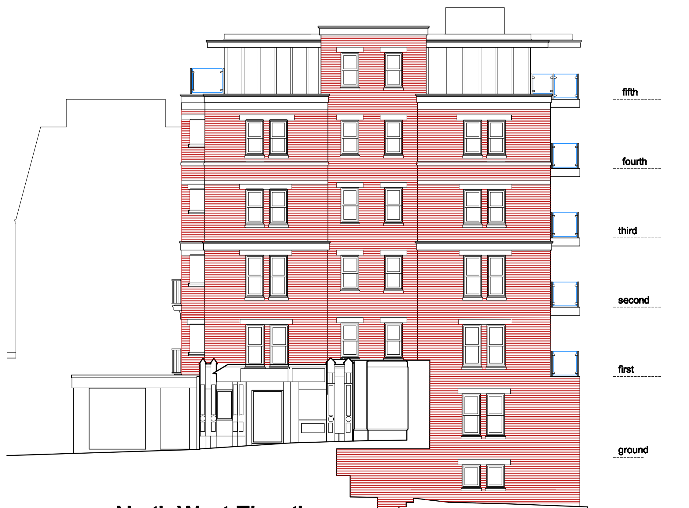
North West Elevation (Opposite Finchley Rd & Frogna Stn)