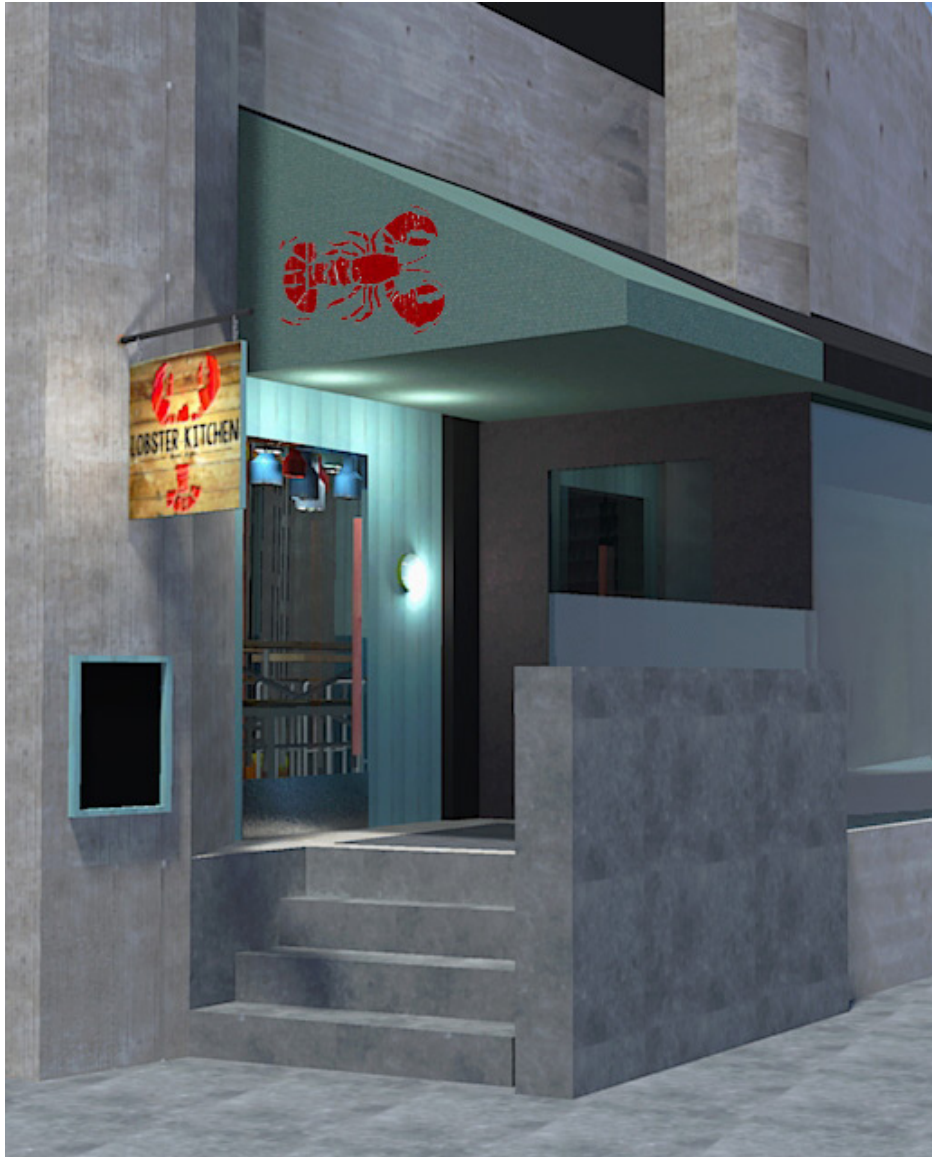
PROPOSED EXTERIOR RENDER