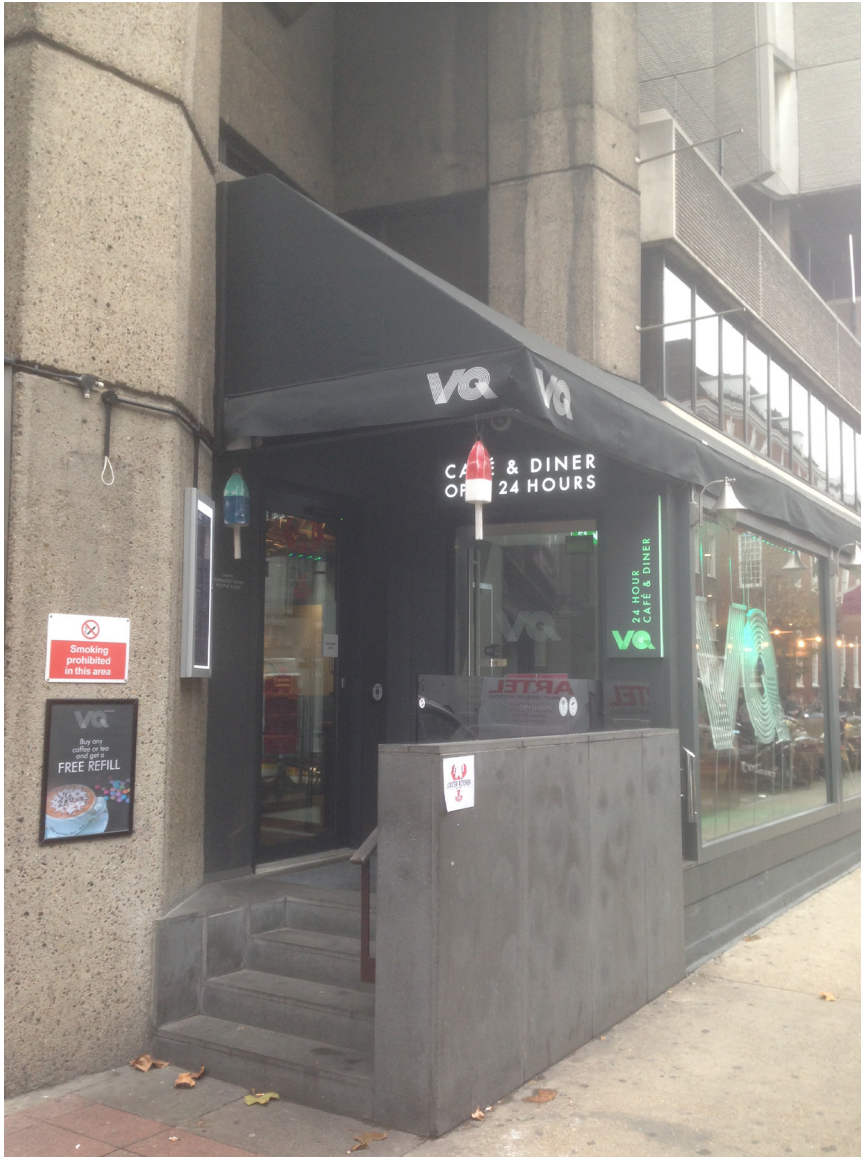
EXISTING EXTERIOR PHOTO