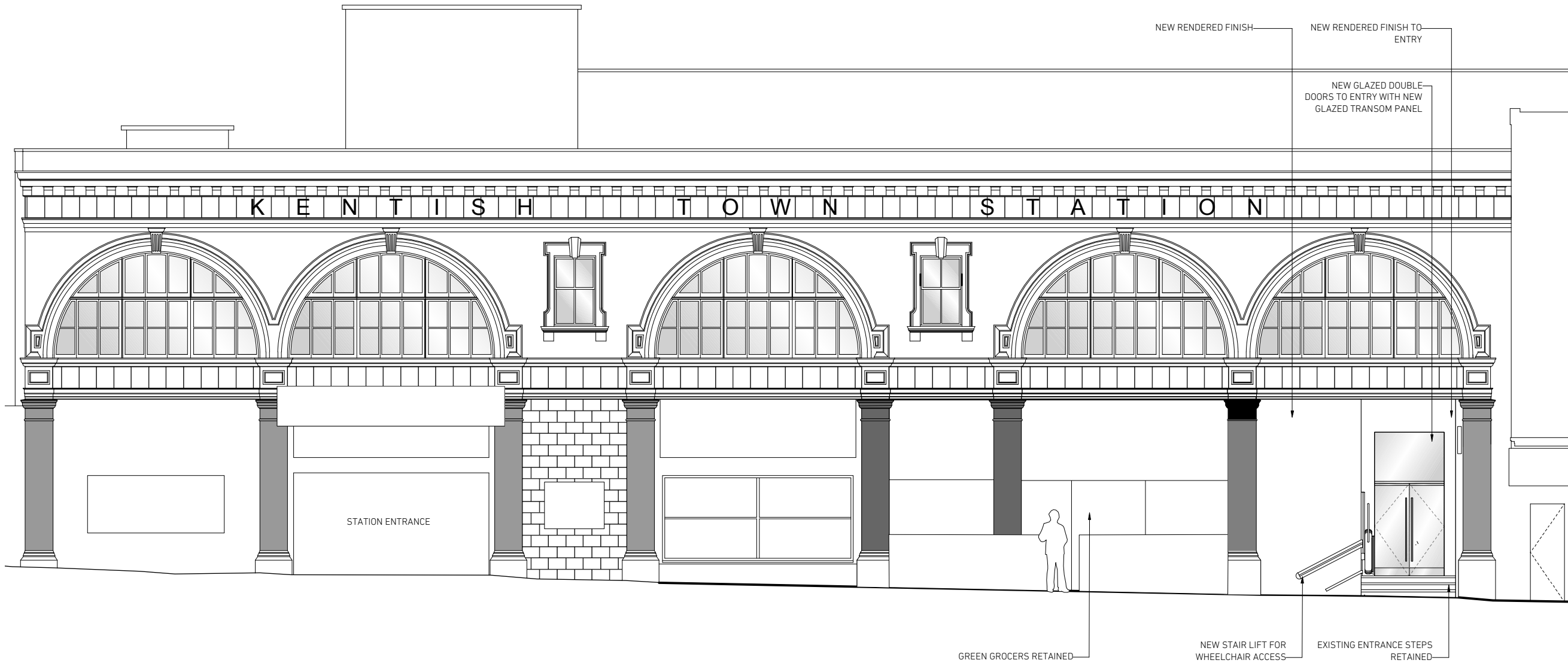
1 PROPOSED SHOPFRONT ELEVATION AWNING EXTENDED Scale: 1:50

Softroom 3 Murphy Street London SE1 7FP www.softroom.com softroom@softroom.com +44 (0) 203 597 6888 Verify all dimensions on site. Do not Scale