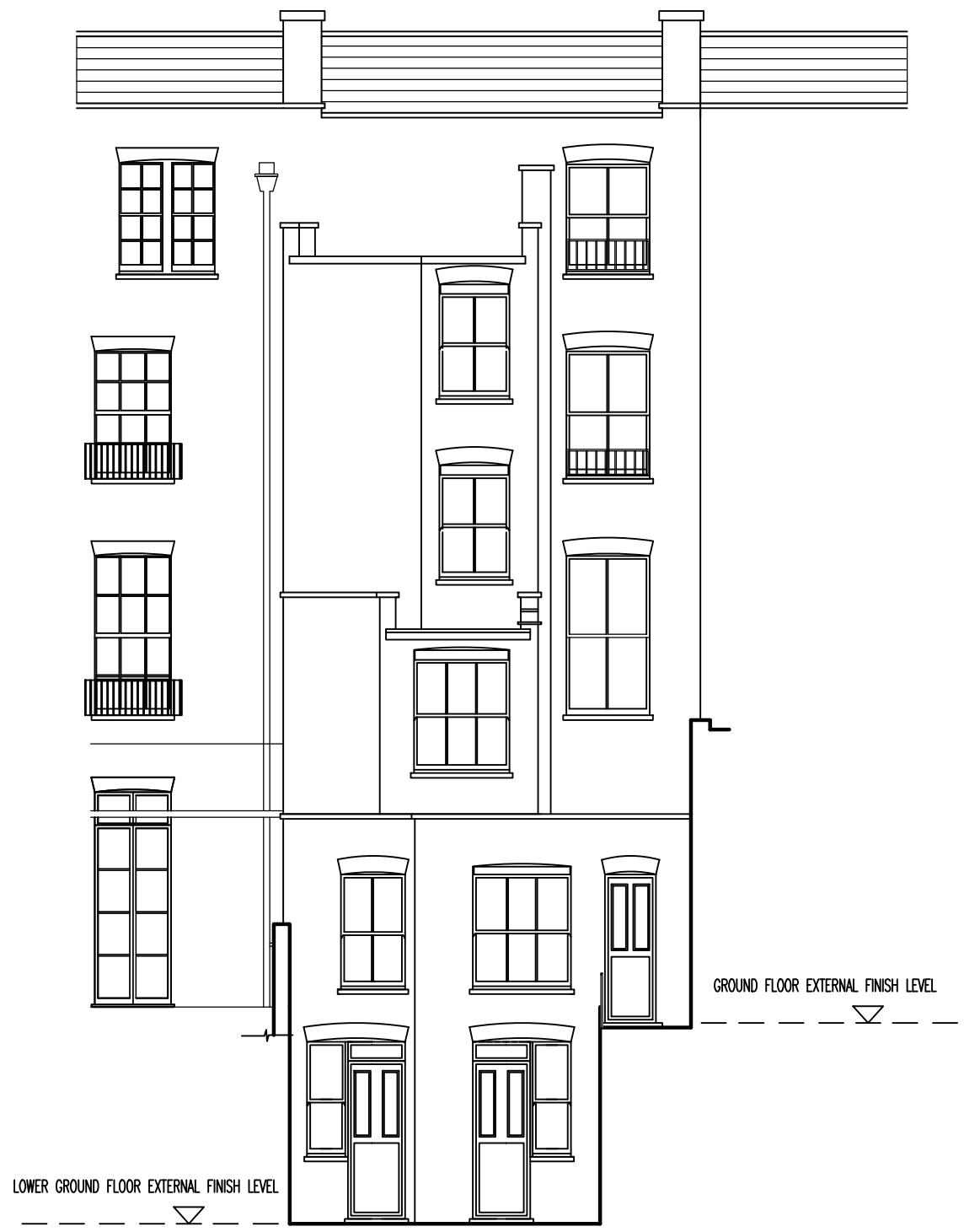
PROPOSED REAR ELEVATION (INDICATING LOWER GROUND FLOOR)