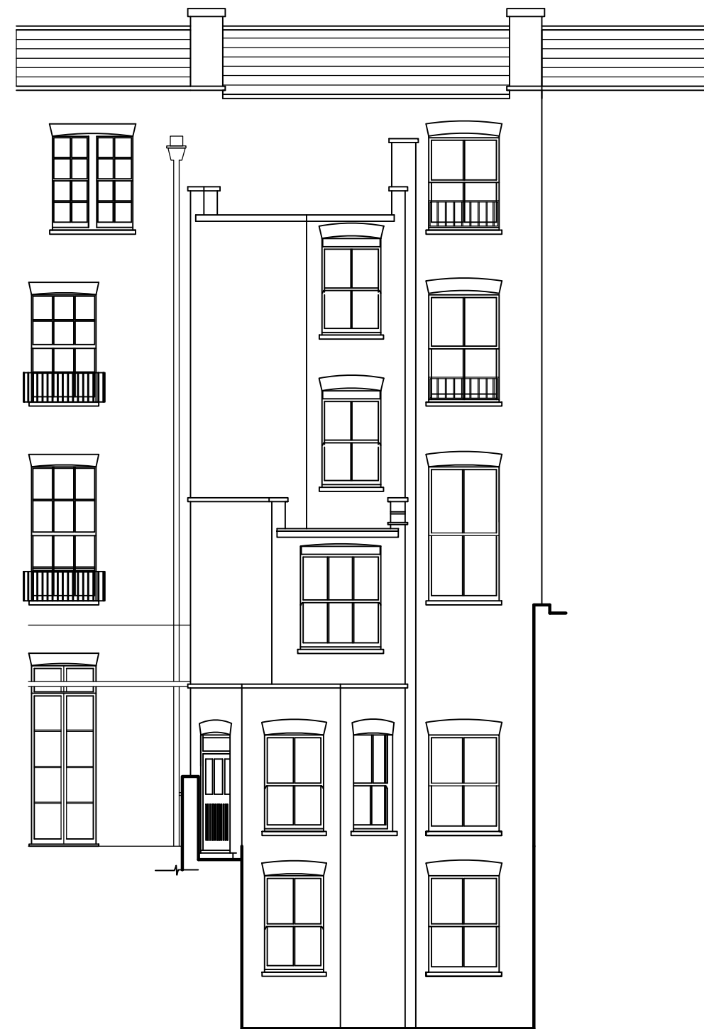
EXISTING REAR ELEVATION (INDICATING LOWER GROUND FLOOR)