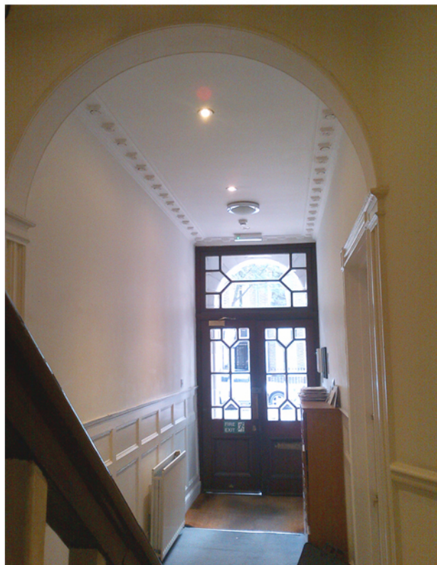
GROUND FLOOR VIEW TOWARDS ENTRANCE