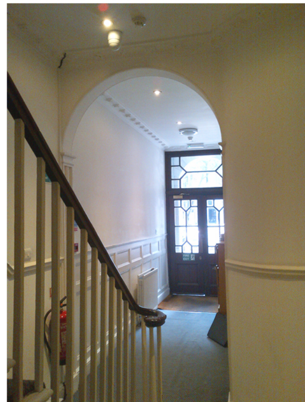
GROUND FLOOR VIEW TOWARDS ENTRANCE