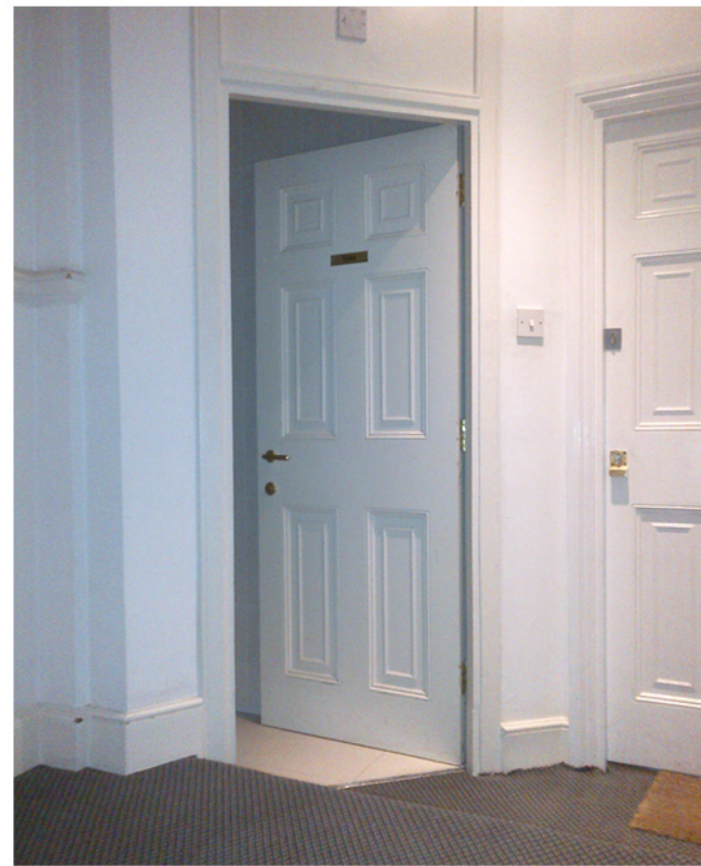
VIEW TOWARDS WC ADJOINING ROOM 12