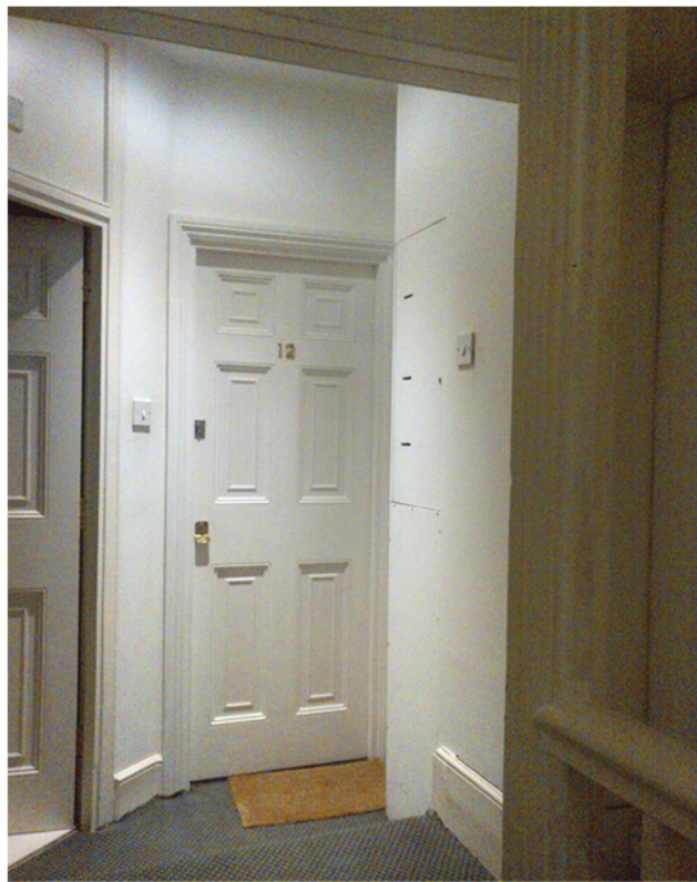
VIEW TOWARDS ROOM 12