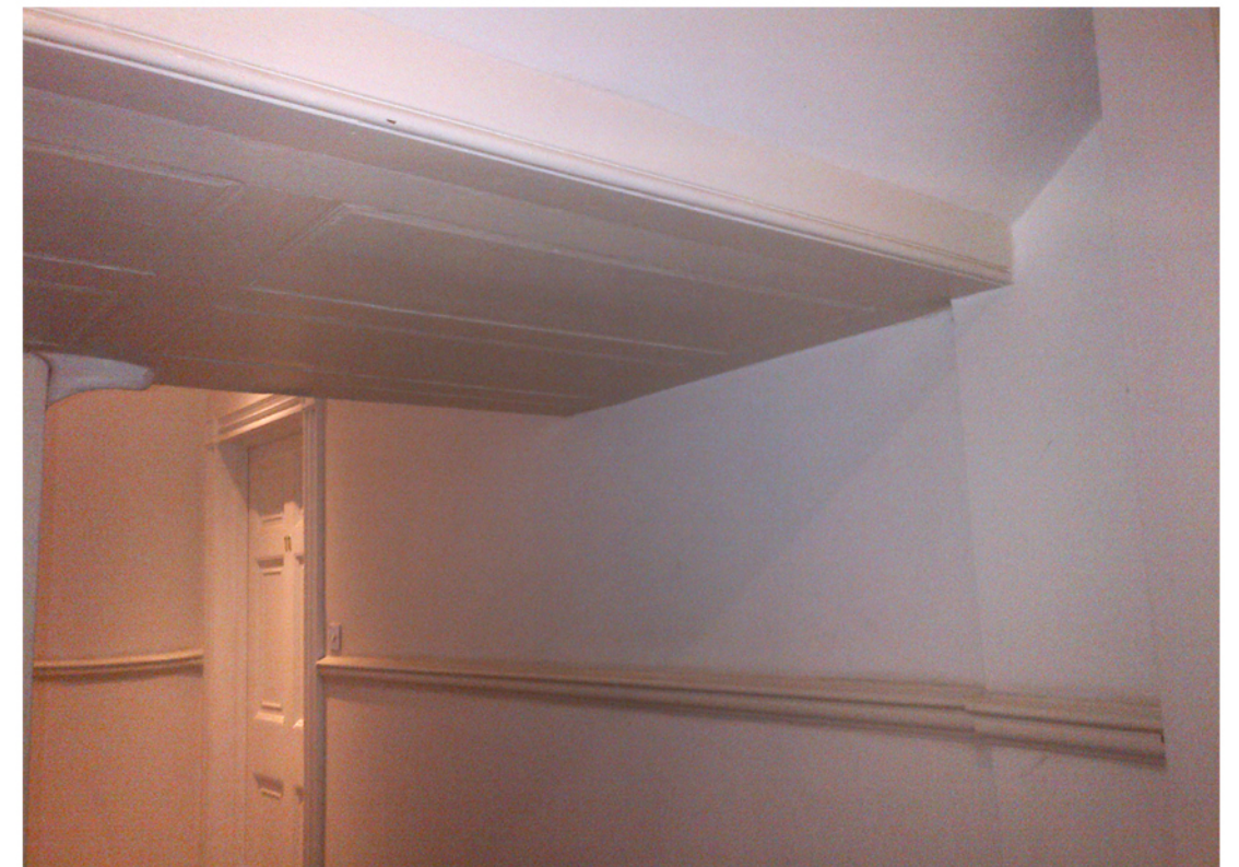
VIEW FROM ROOM 12 TOWARDS ROOM 11 WITH BUCKHEAD TO FIRST FLOOR STAIRCASE IN FORE GROUND