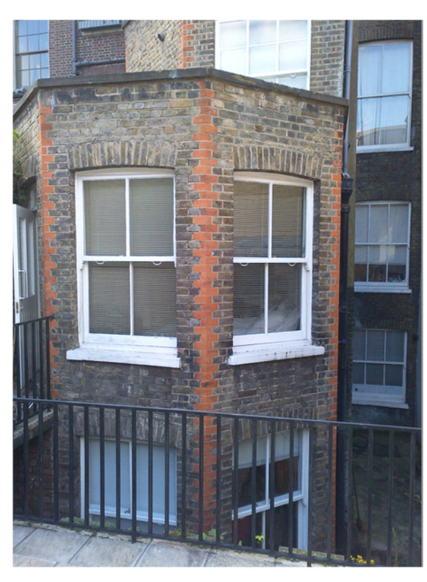
VIEW D VIEW F