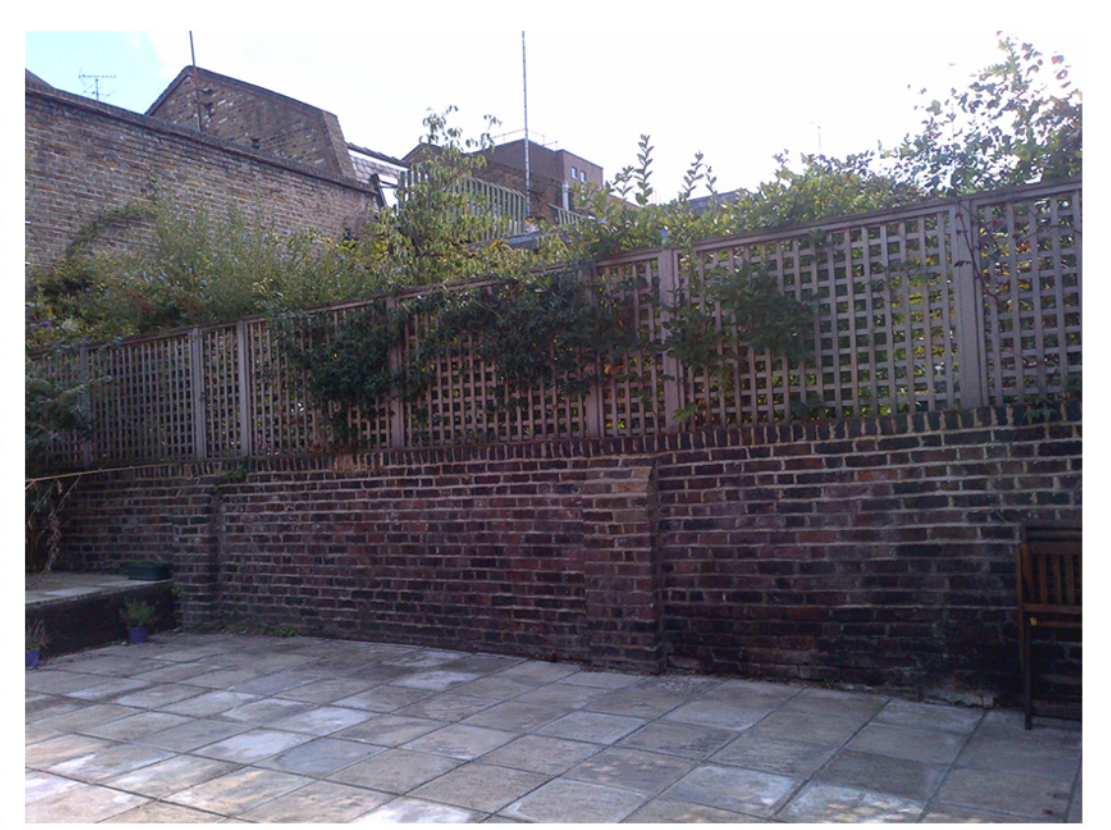
VIEW A VIEW B VIEW C