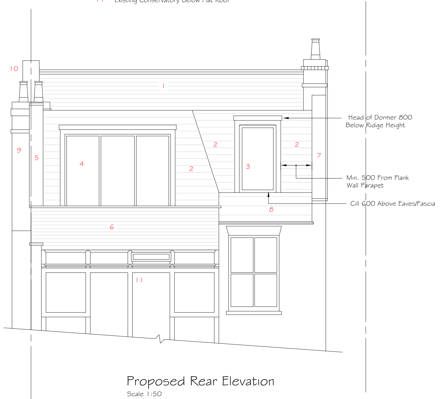
Proposed Rear Elevation Scale 1:50