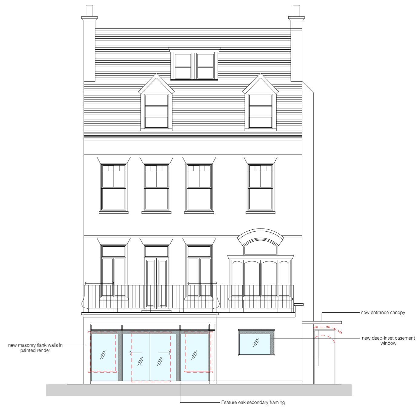
03 PROPOSED REAR ELEVATION 3 scale - 1:100 @ A3

KEY EXISTING WALL LINES TO BE DEMOLISHED