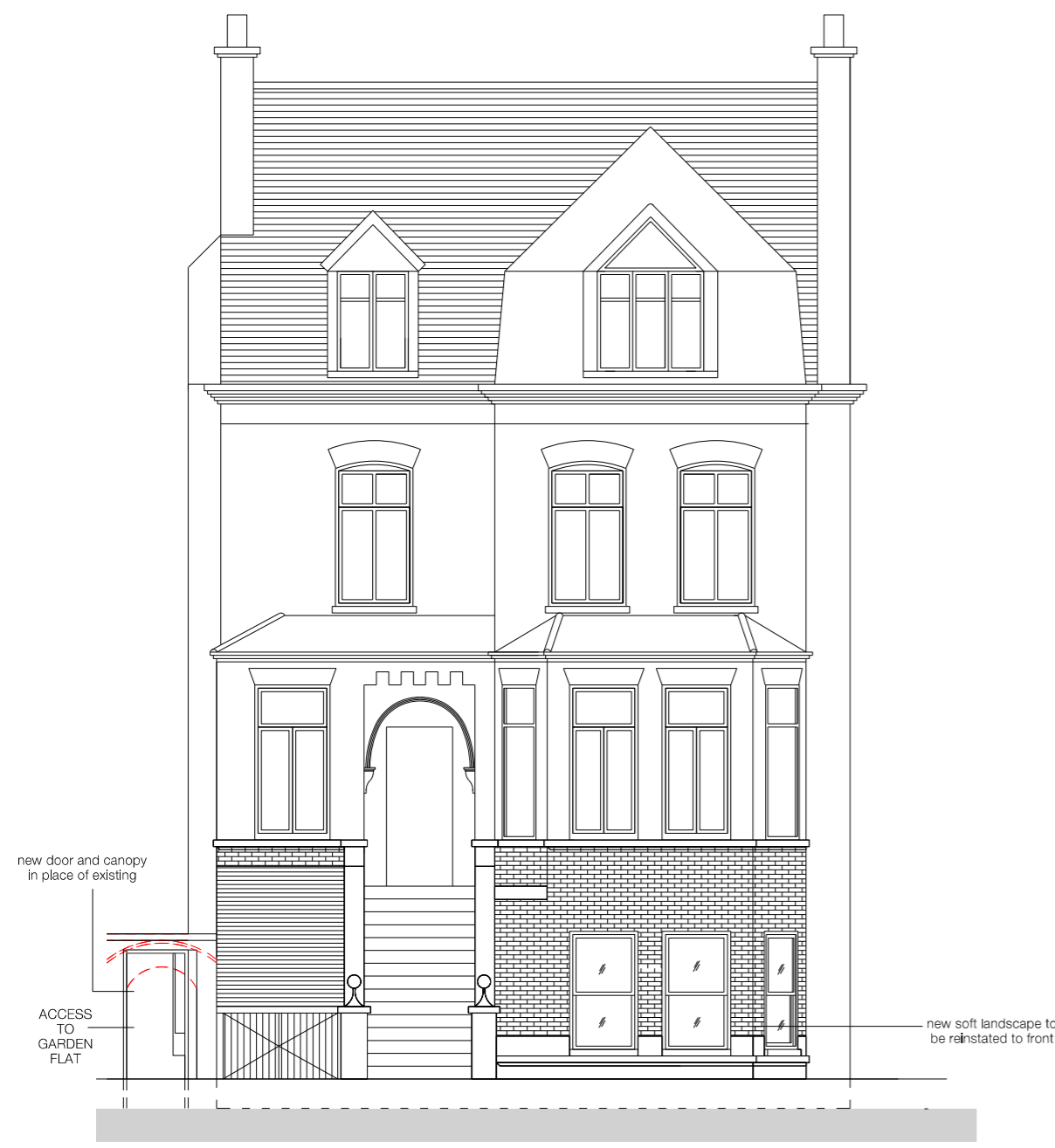
02 PROPOSED FRONT ELEVATION 1 scale - 1:100 @ A3