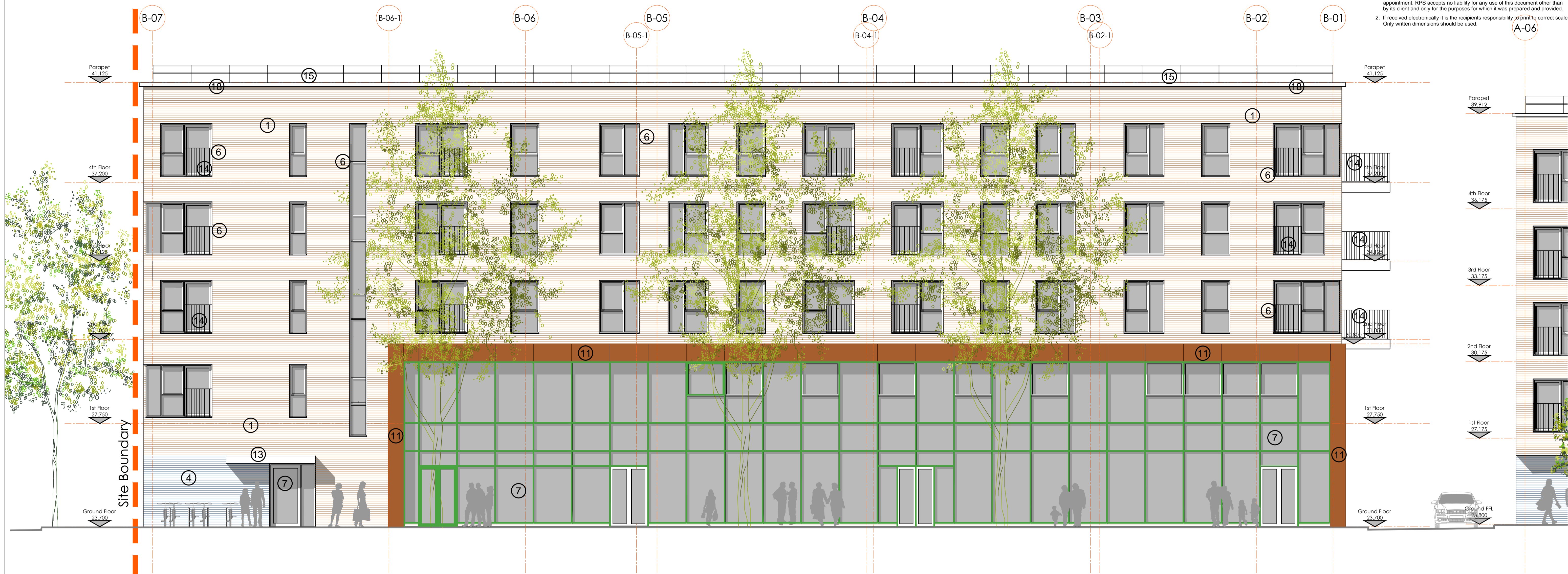
Plender Street B North Elevation Proposed

Notes 1. This drawing has been prepared in accordance with the scope of RPS's appointment with its client and is subject to the terms and conditions of that appointment. RPS accepts no liability for any use of this document other than by its client and only for the purposes for which it was prepared and provided. 2. If received electronically it is the recipient's responsibility to print to correct scale. Only written dimensions should be used.