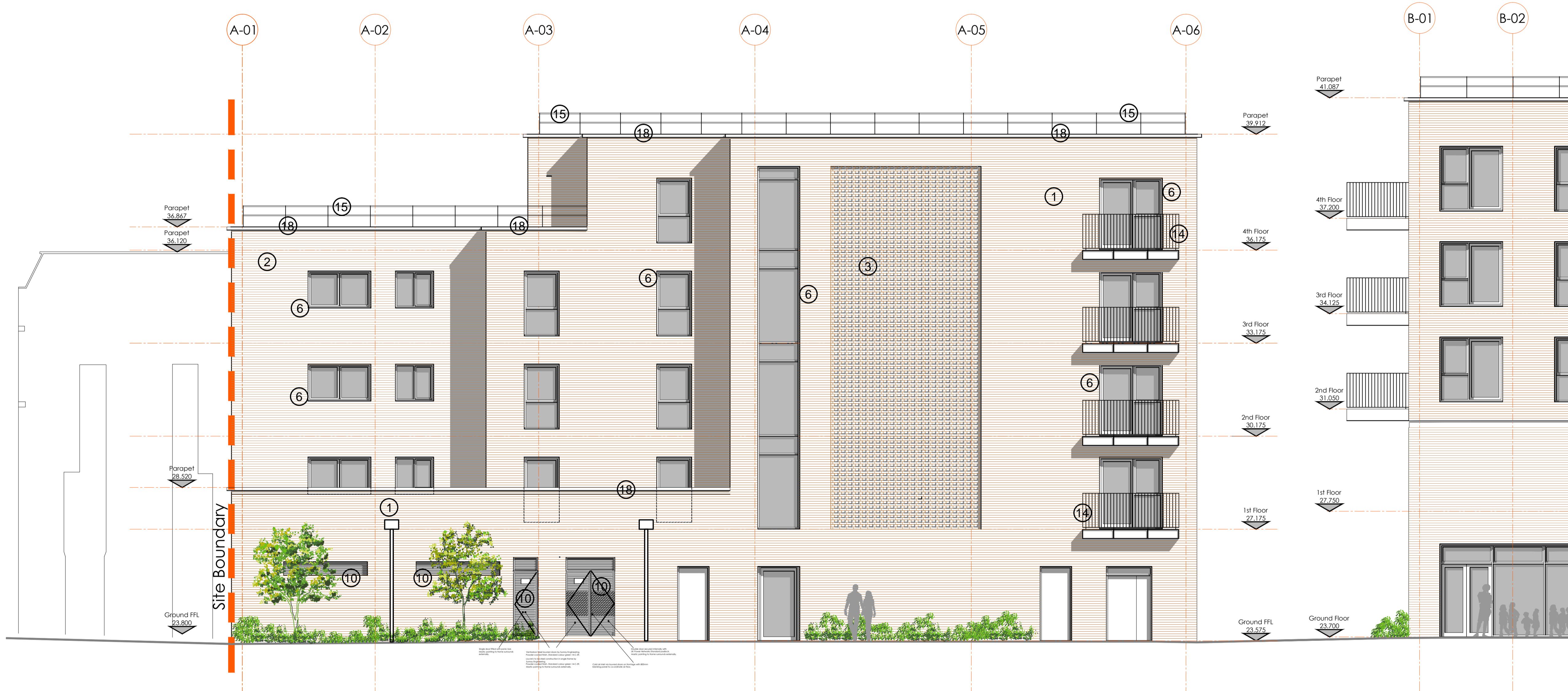
Plender Street A South Elevation Proposed