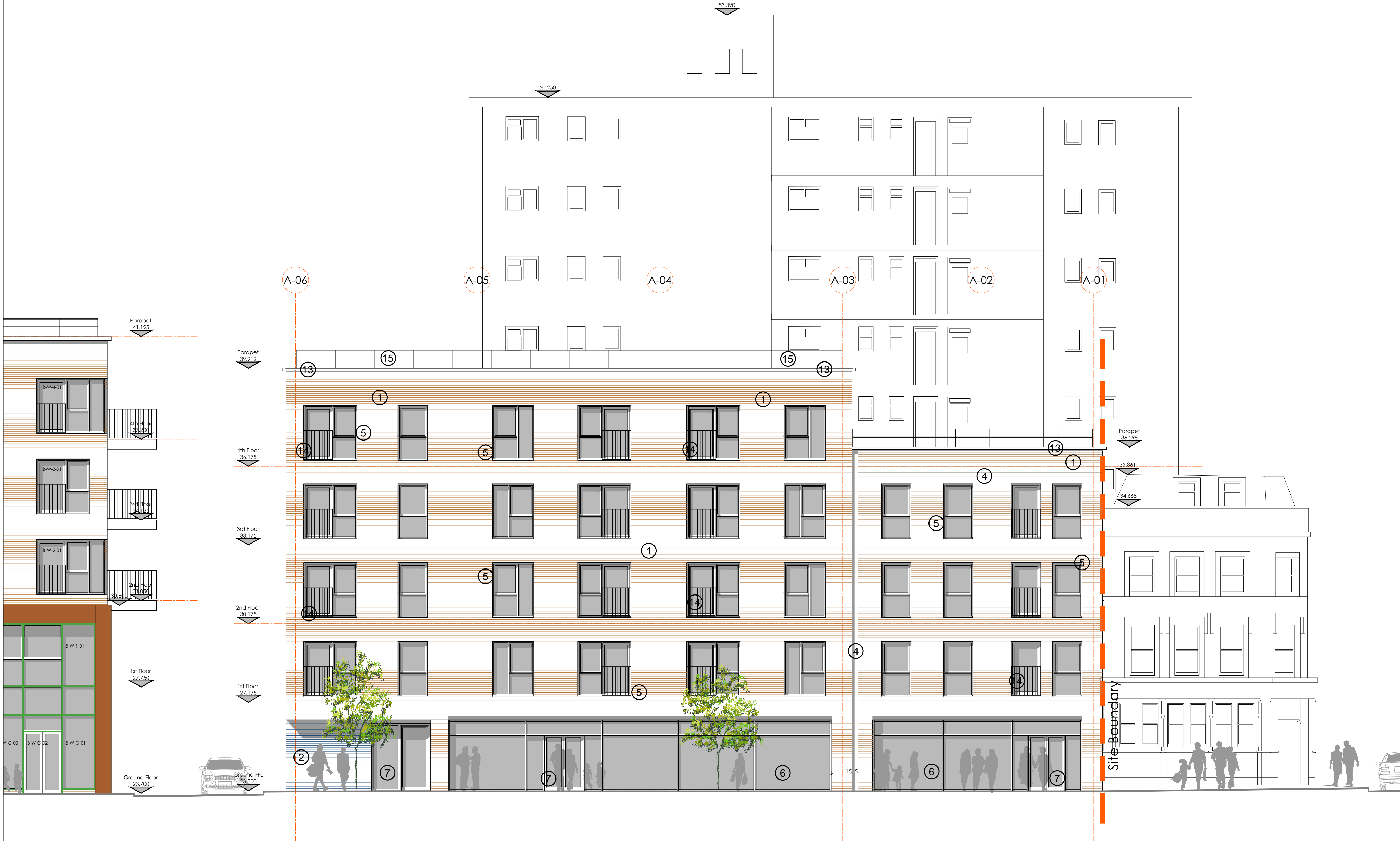
Plender Street A North Elevation Proposed