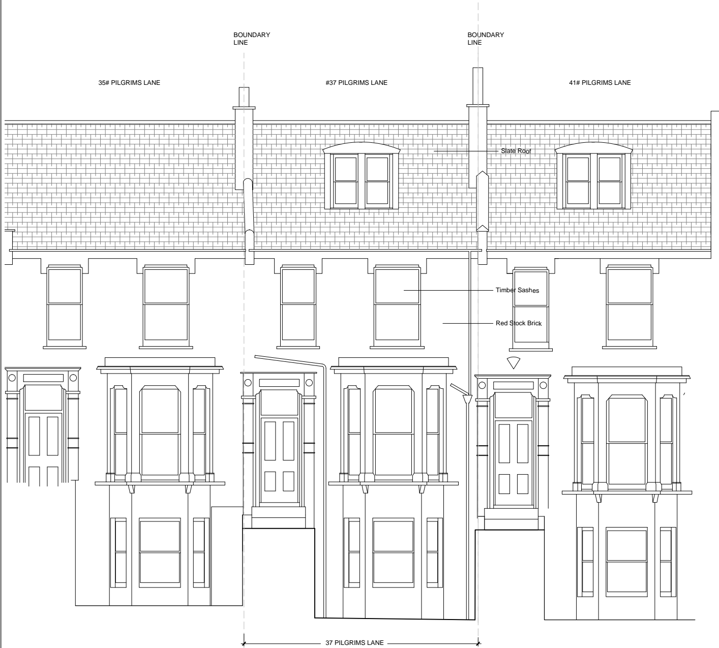
Front Elevation (View from Lightwell)