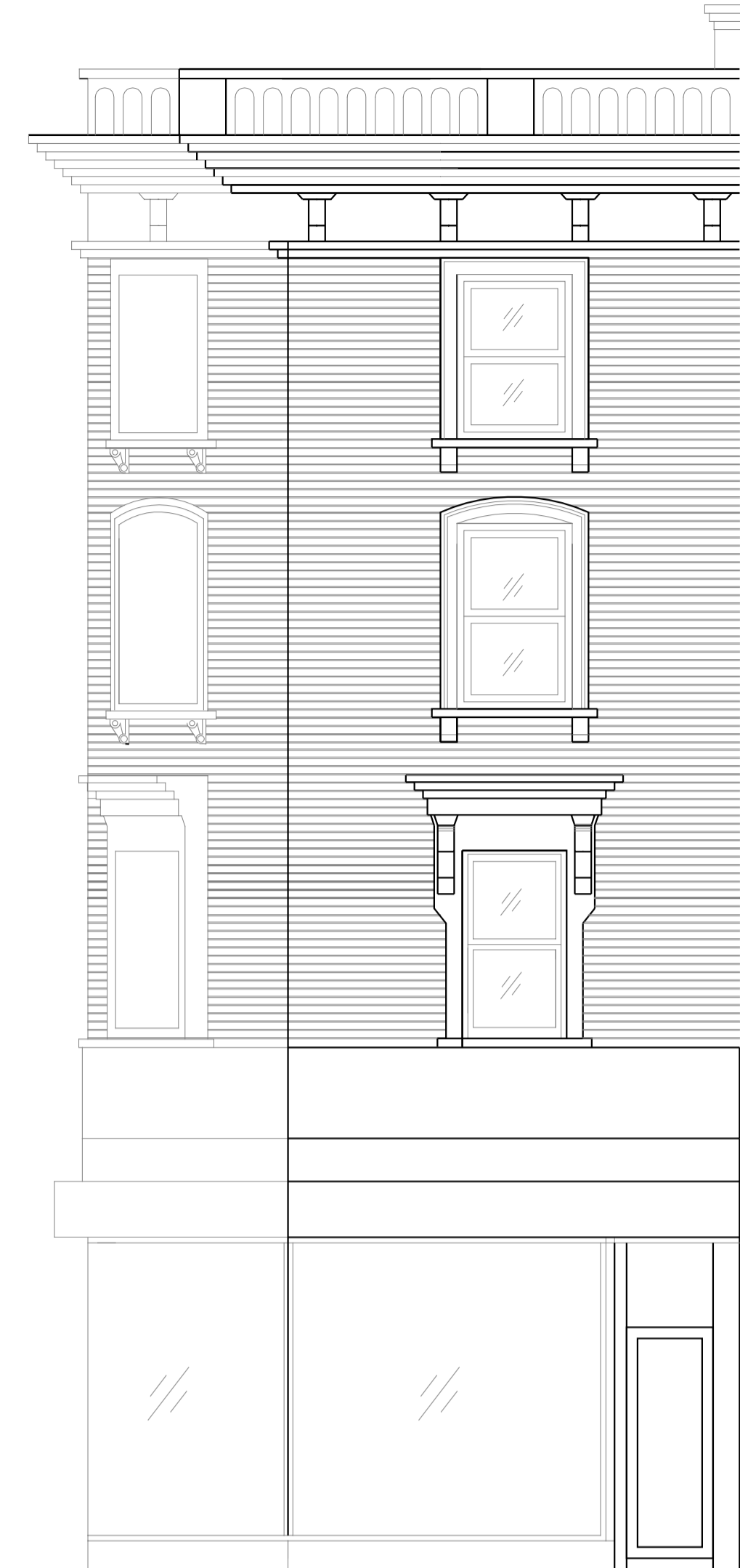
EXISTING ELEVATION TO KILBURN HIGH ROAD SCALE 1:50 @ A1 AND 1:100 @ A3