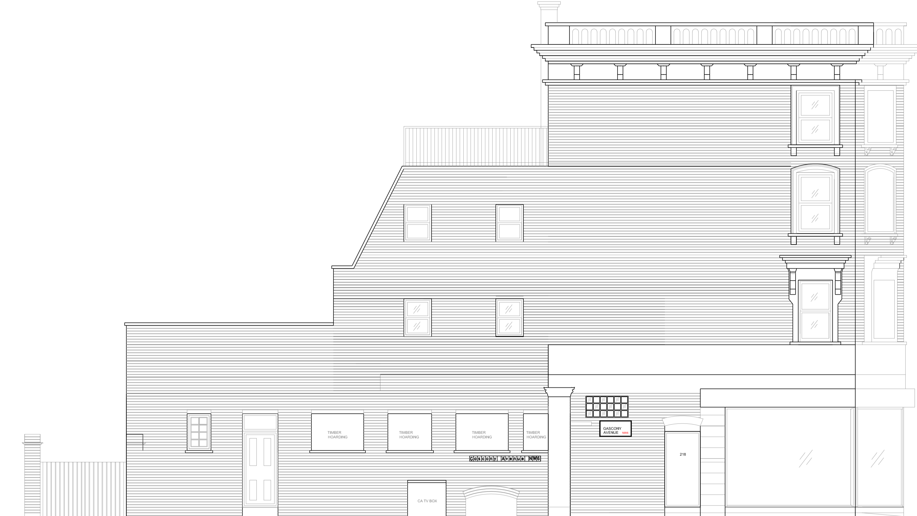
EXISTING ELEVATION TO GASCONY AVE SCALE 1:50 @ A1 AND 1:100 @ A3