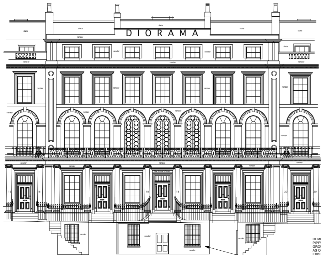
(THROUGH LIGHTWELLS) PROPOSED WEST ELEVATION (PARK SQUARE EAST) A.O.D. 23.00M

REMOVAL OF MODERN M&E APARATUS AND PIPEWORK AT LIGHTWELL LEVEL BELOW GROUND ASSOCIATED WITH THE BUILDING AS OFFICES. FOLLOWING REMOVAL ALL EXISTING WALLS MADE GOOD TO MATCH EXISTING USING EXISTING MATERIALS AND TECHNIQUES