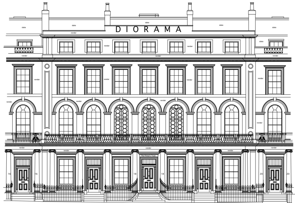
(STREET ELEVATION) PROPOSED WEST ELEVATION (PARK SQUARE EAST) A.O.D. 23.00M