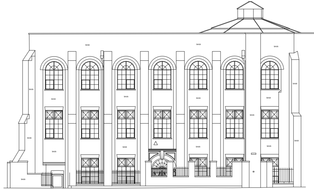
(STREET ELEVATION) (6) SOUTH-EAST ELEVATION A.O.D. 23.00M