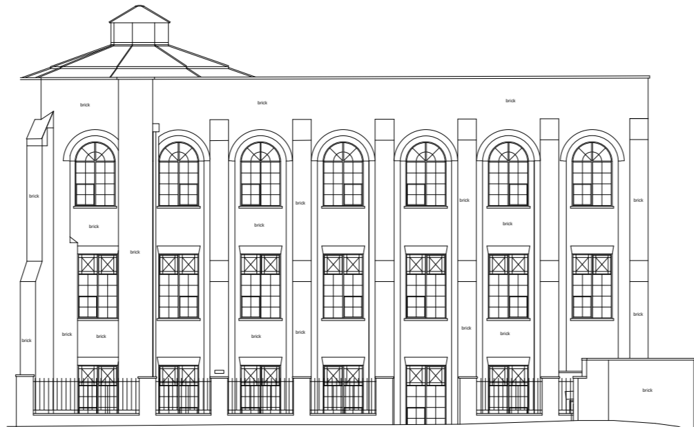
(STREET ELEVATION) (4) NORTH-EAST ELEVATION A.O.D. 23.00M