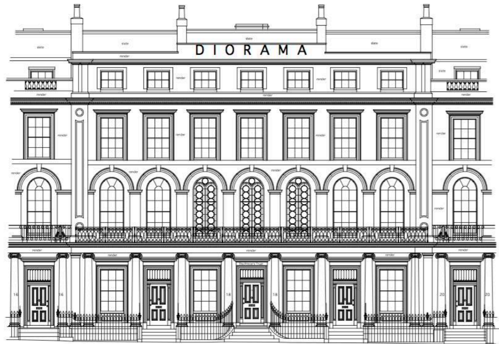
(STREET ELEVATION) WEST ELEVATION (PARK SQUARE EAST) A.O.D. 23.00M