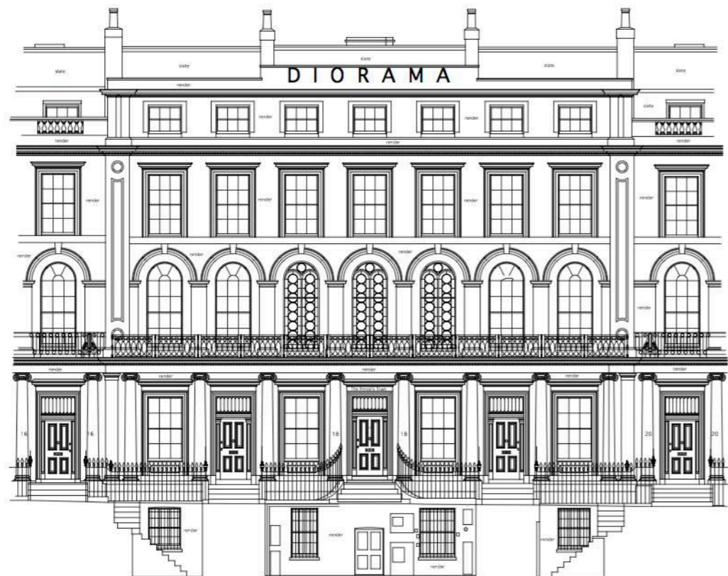
(THROUGH LIGHTWELLS) WEST ELEVATION (PARK SQUARE EAST) A.O.D. 23.00M