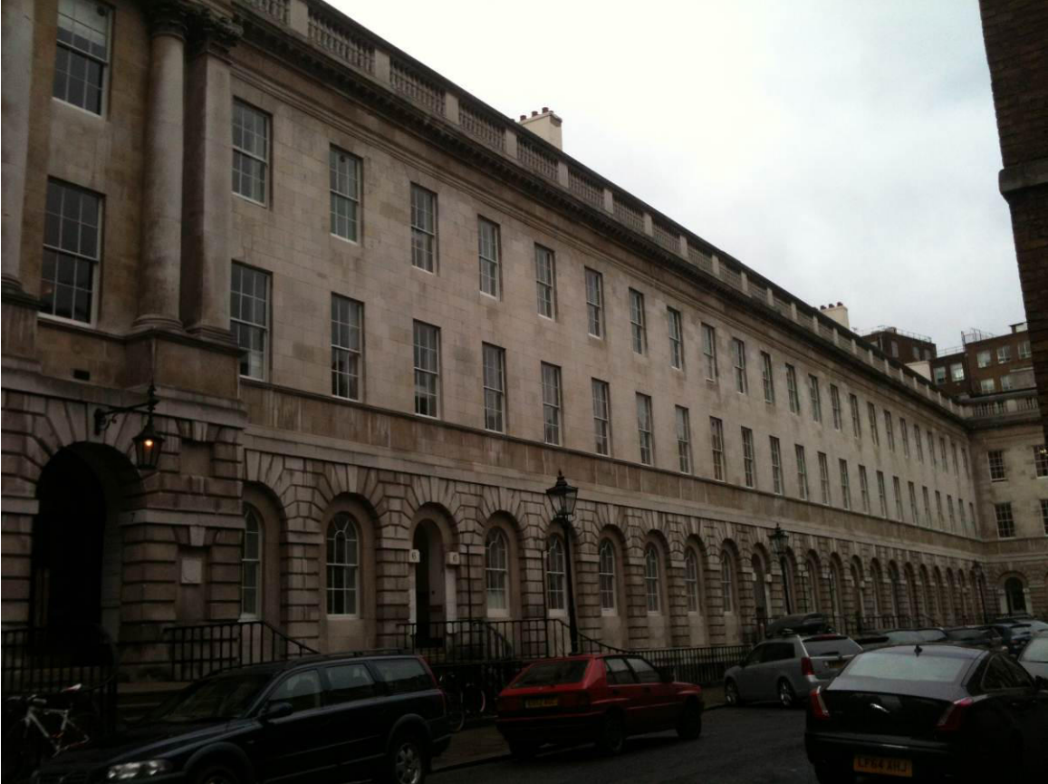
View to front of 1-7 Stone Buildings from ground level