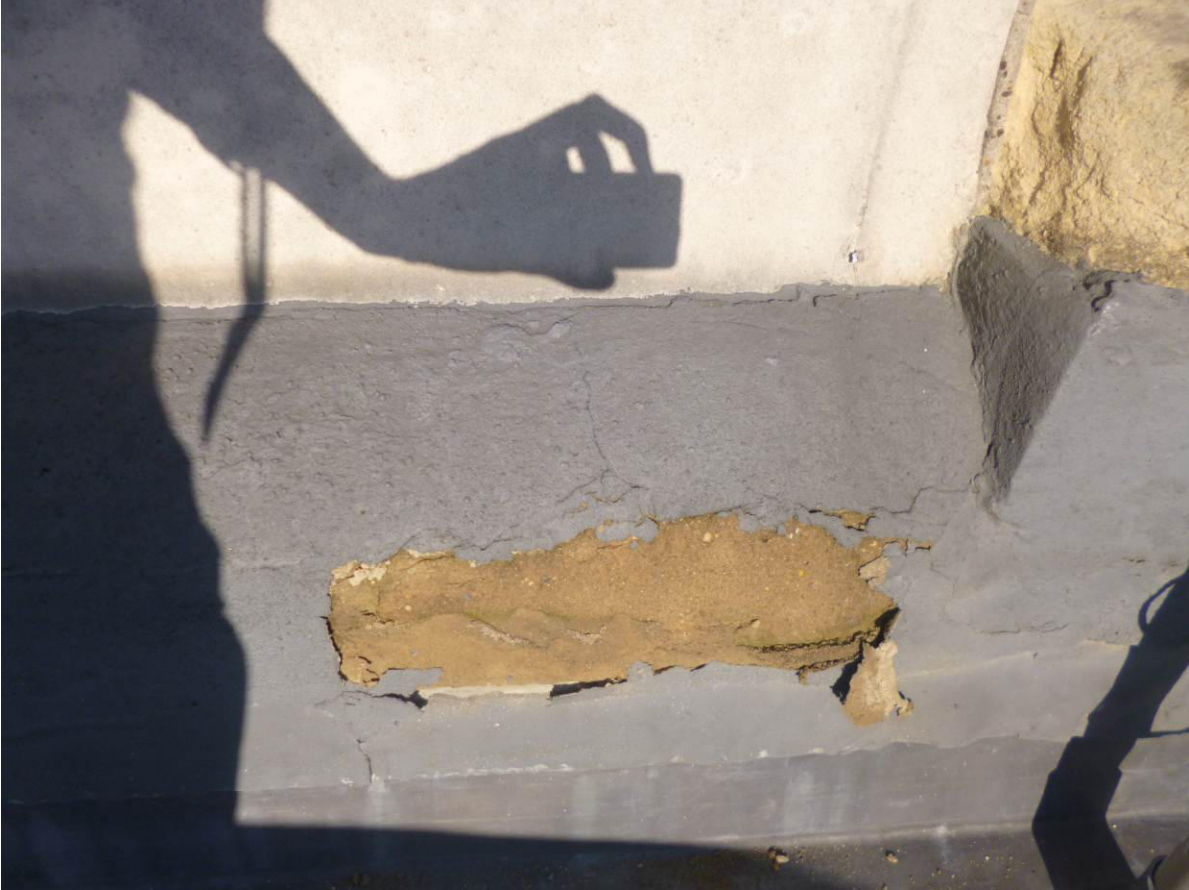
Defective flashing detail to stone work to roof of no.7 Stone Buildings.