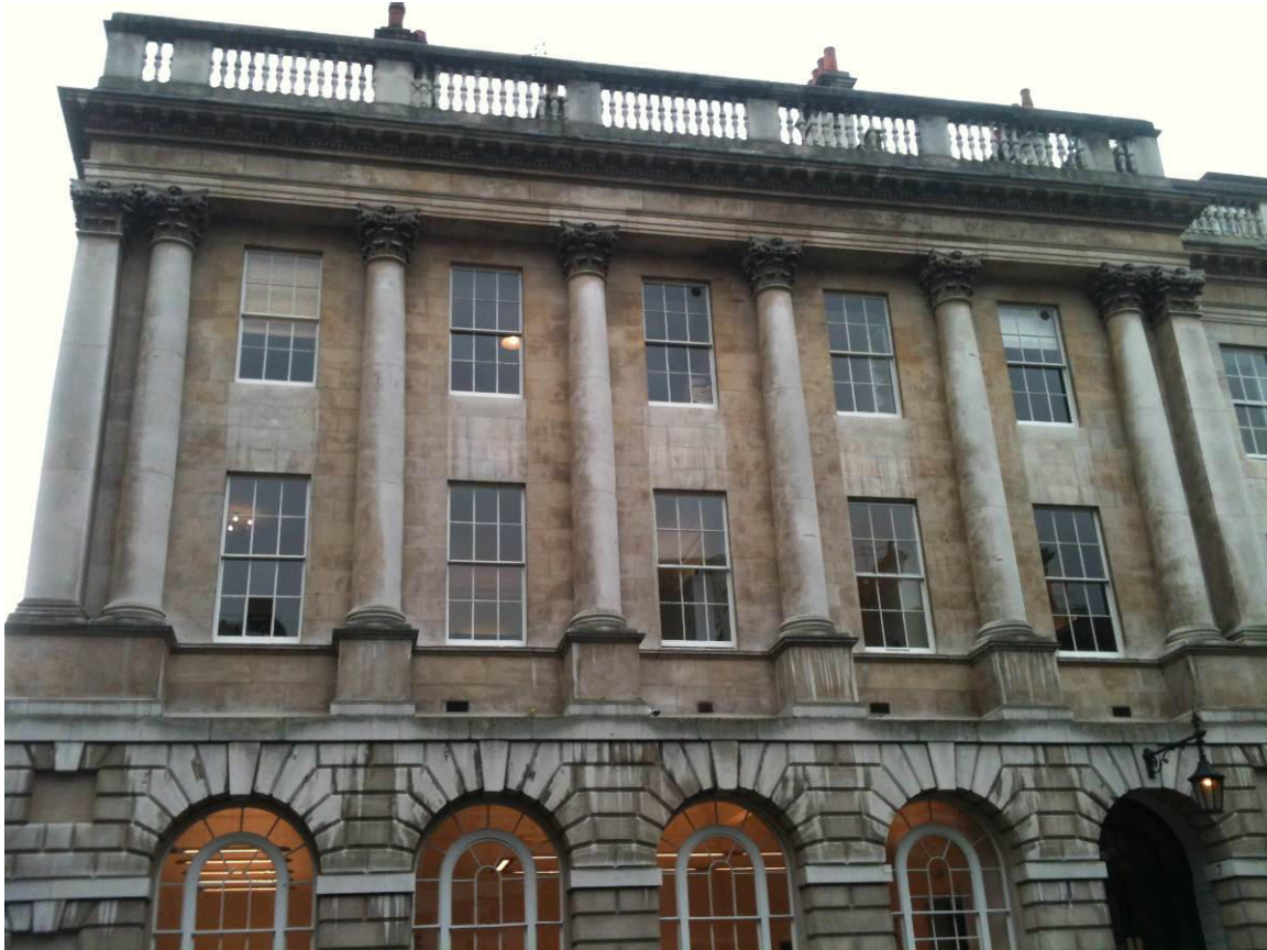
View of no.7 Stone Buildings from Ground Level