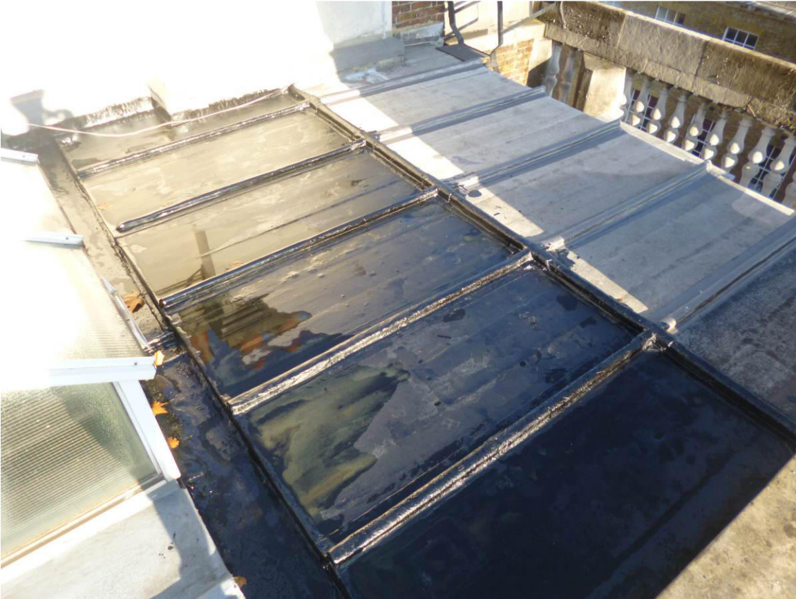
View of ad-hoc liquid membrane repair to lead roof covering to No.7 Stone Buildings.