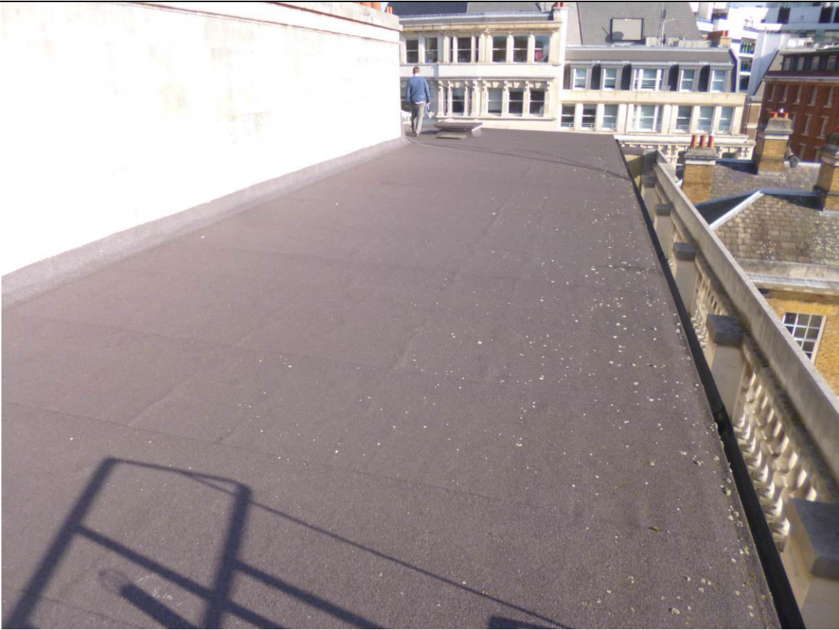
View of flat roof to receive proposed edge protection.