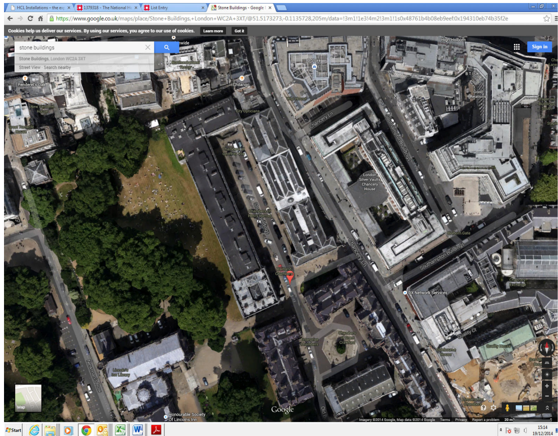
Lincoln's Inn Estate

Nos. 1-11 Stone Buildings are located within Lincoln's Inn.