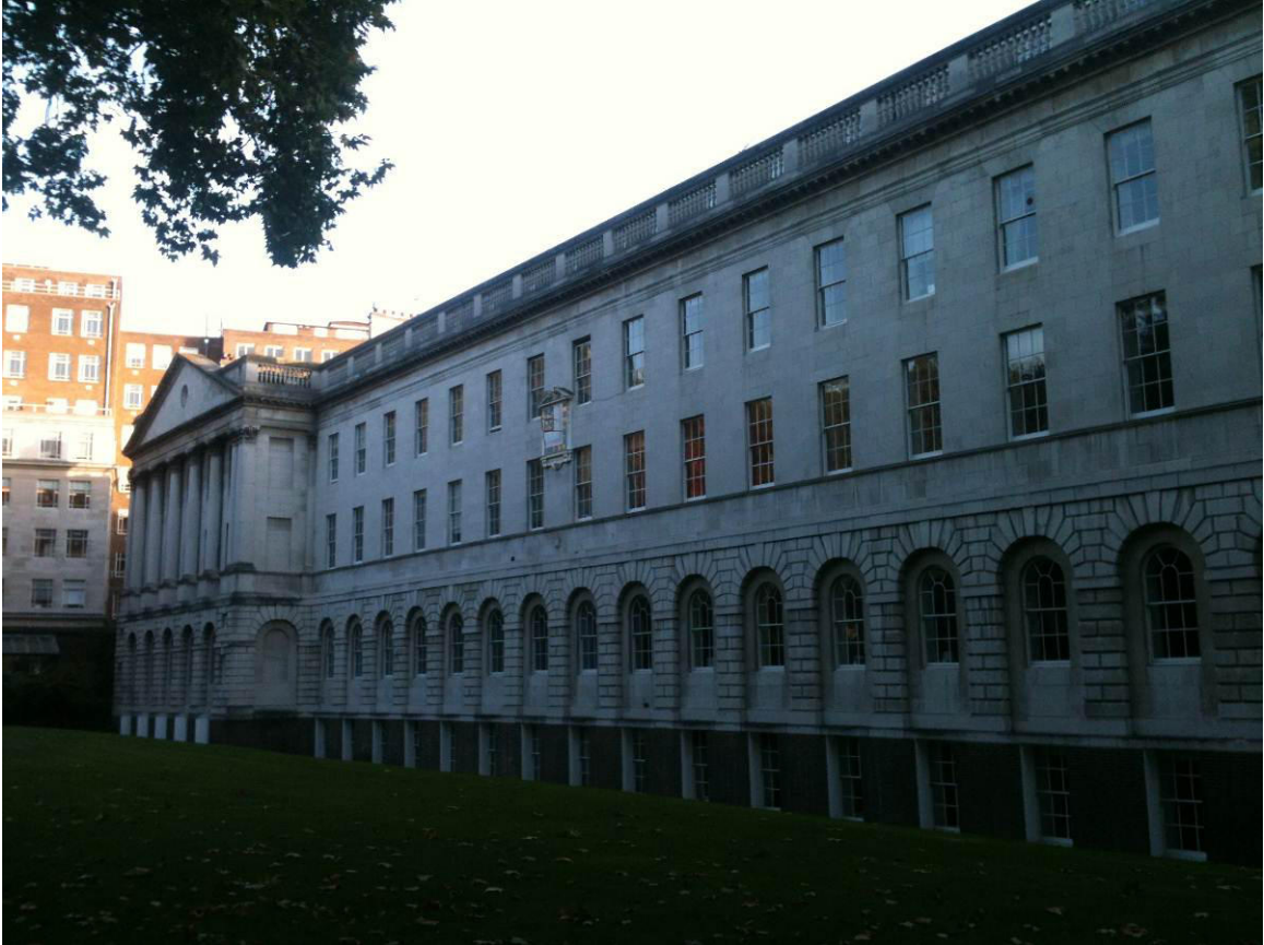
View to Rear of 1-7 stone buildings from ground level