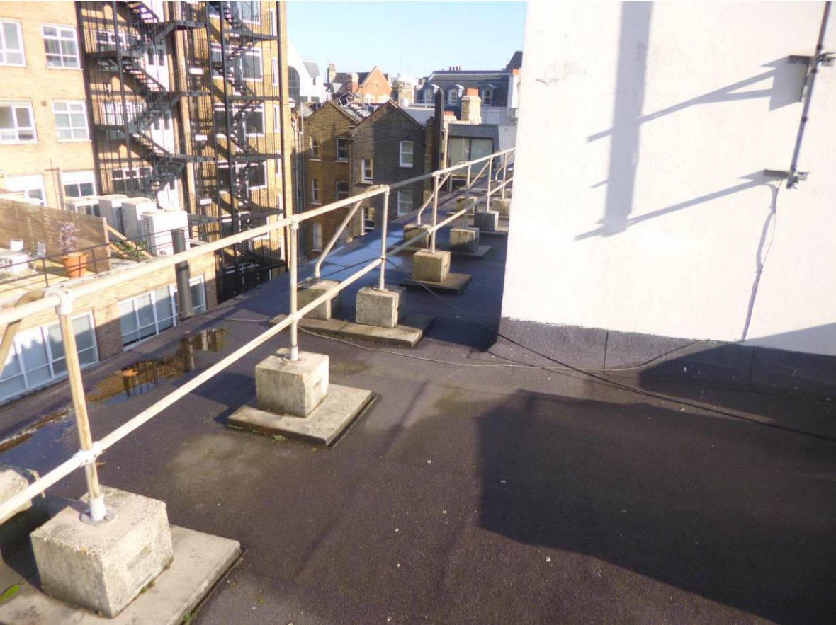
View of Existing Edge Protection to rear elevation of nos.1-3 Stone Buildings.