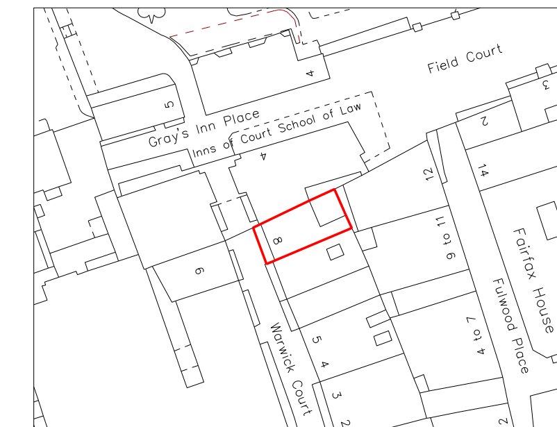
Key Plan 1:1000