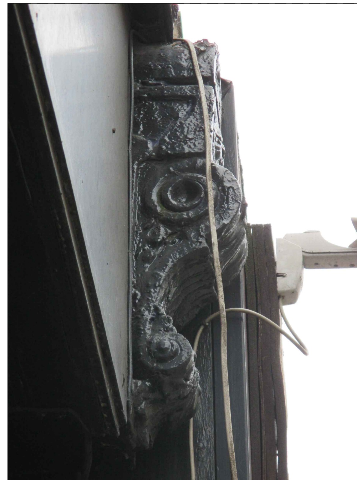
3 1-3 GOODGE ST. ORIGINAL CONSOLE BRACKET SCALE: (A1)