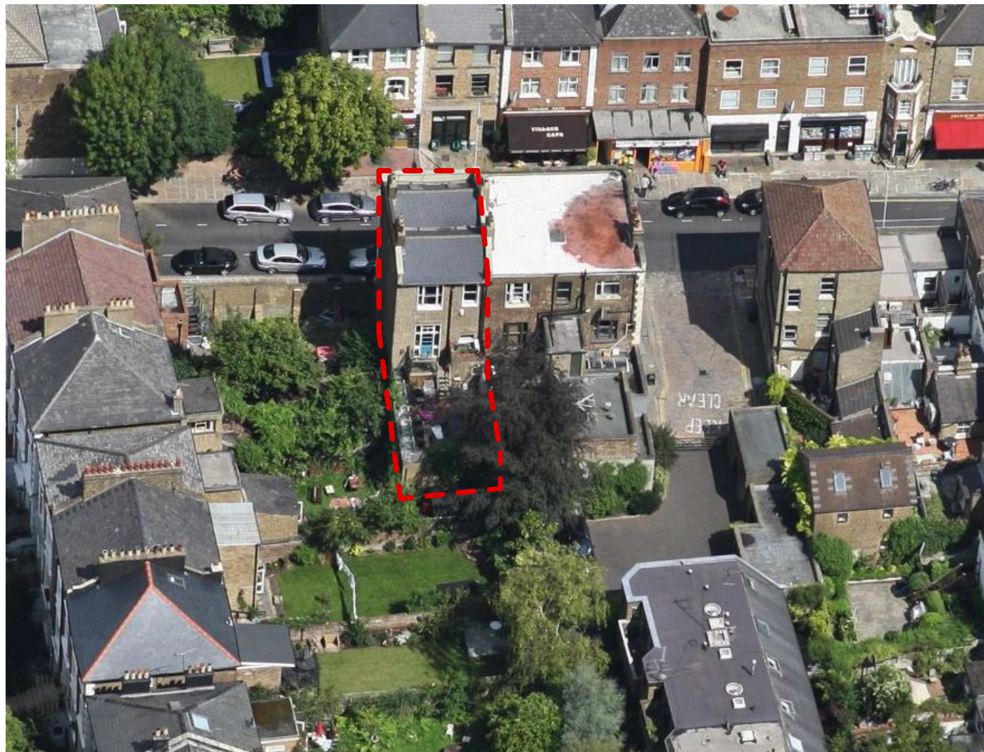
AERIAL VIEW FROM SOUTH-WEST