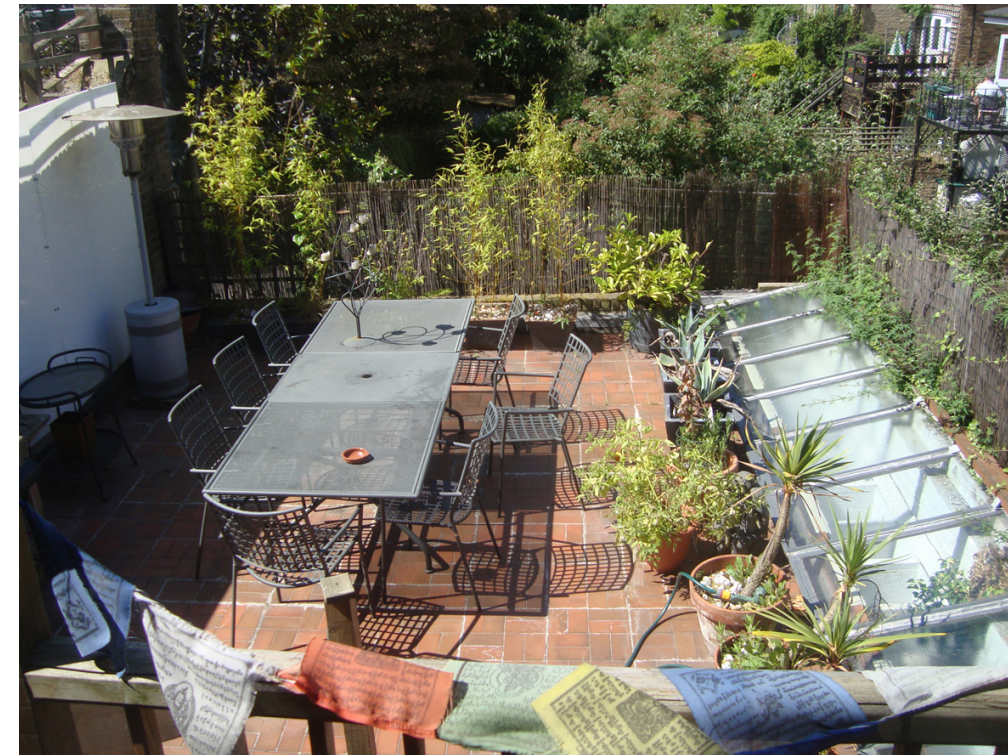
EXISTING REAR TERRACE