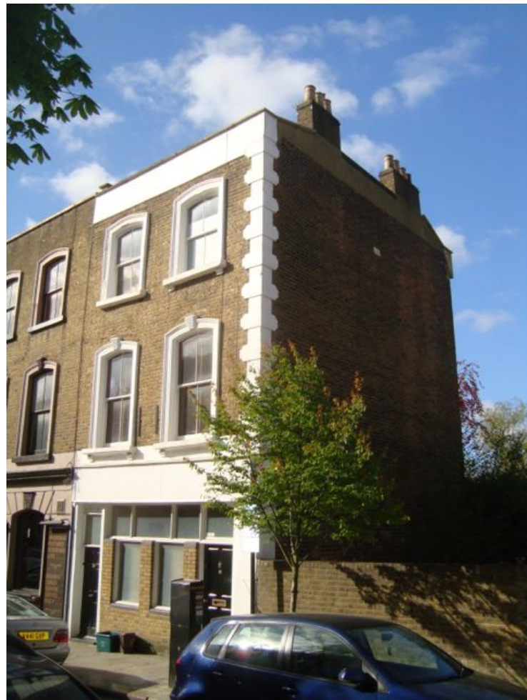
EXISTING STREET ELEVATION