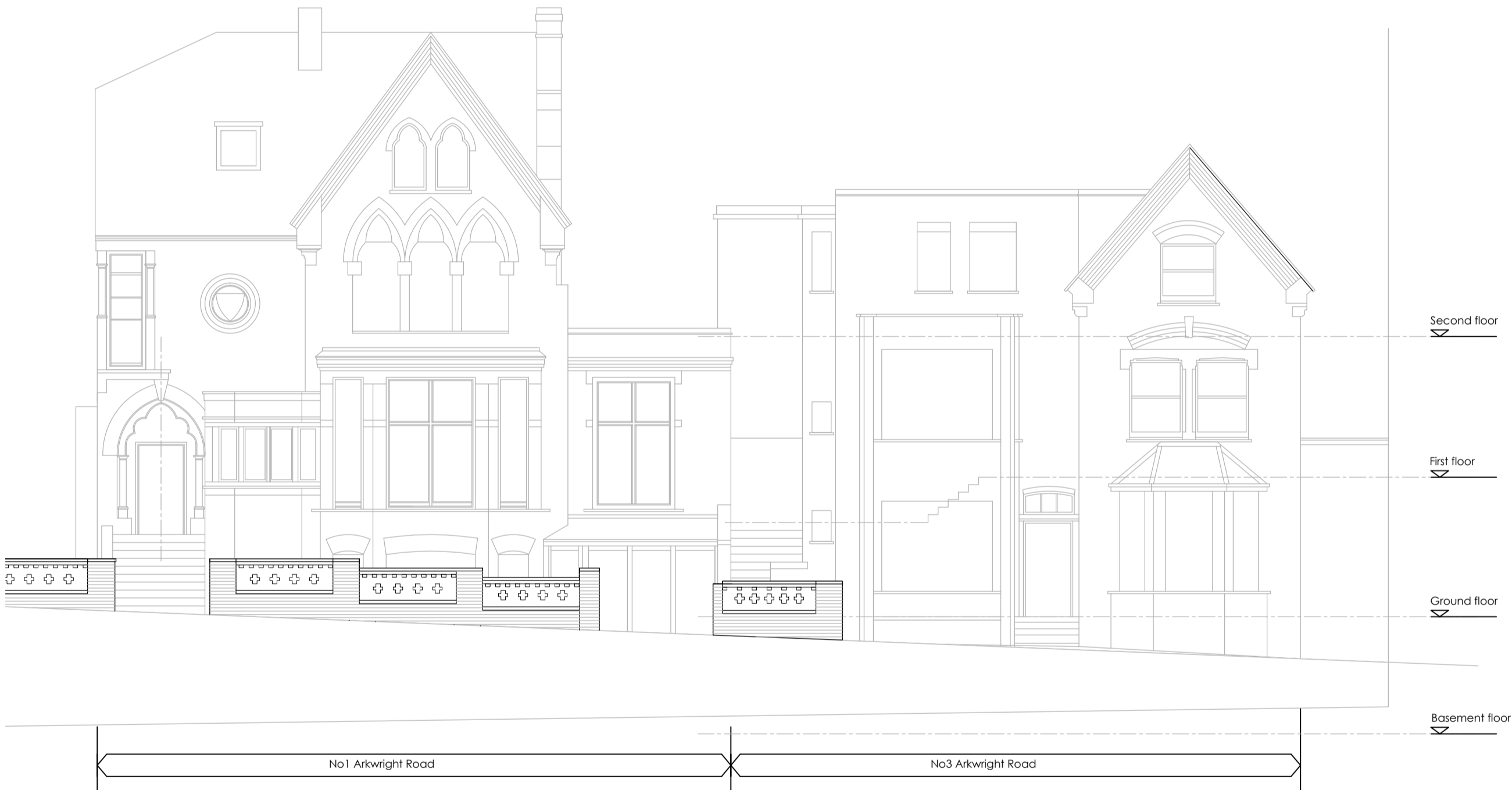
Existing Front Boundary Elevation