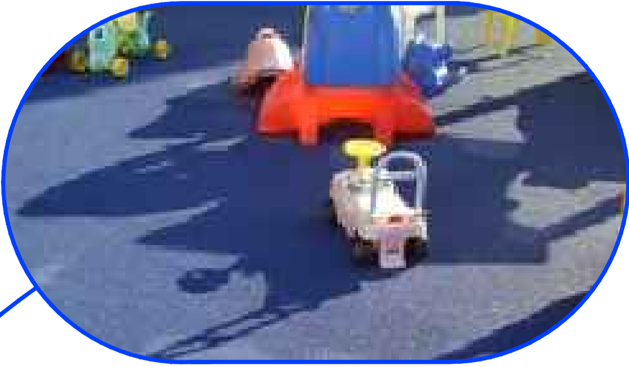
2. external learning blue rubber crumb