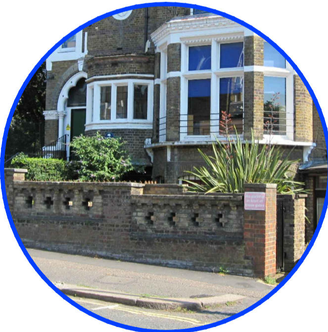
9. boundary wall & gate