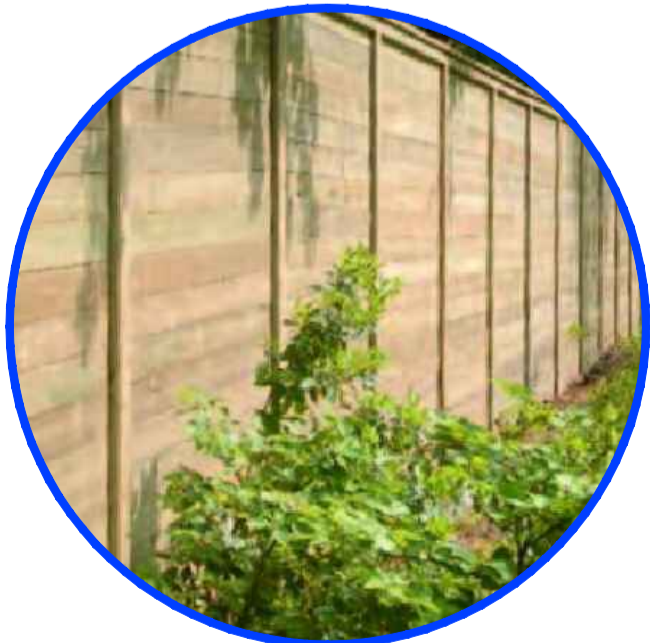
8. acoustic fence