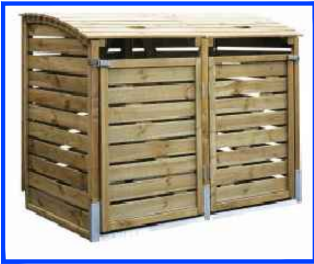
6. bin store