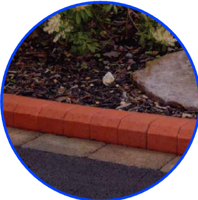
3. pavements & access