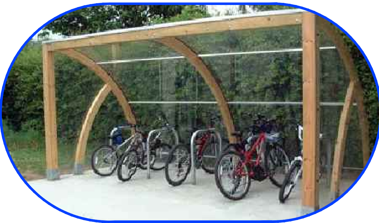
5. cycle store