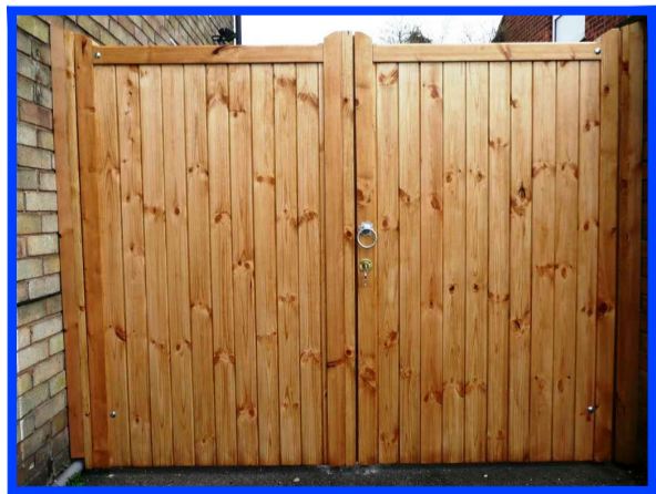
7. access gate