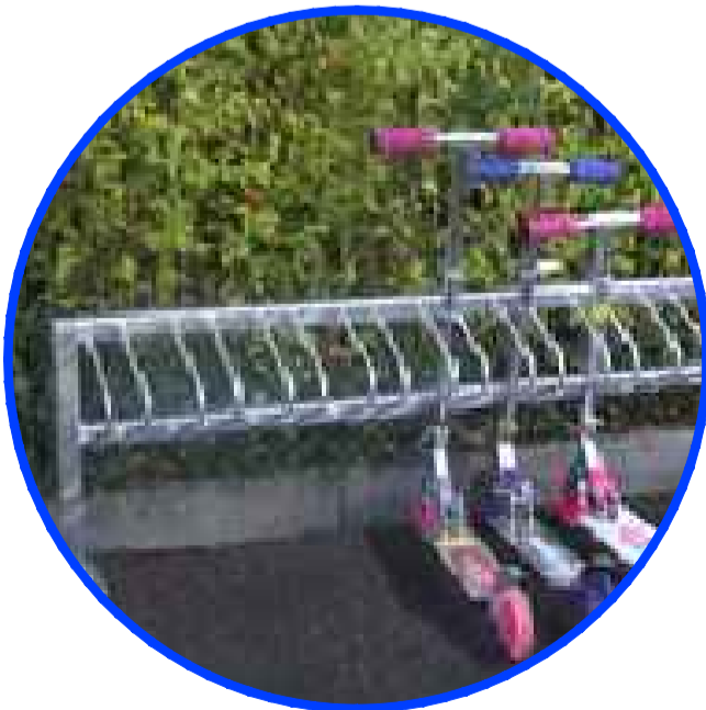
4. scooter parking