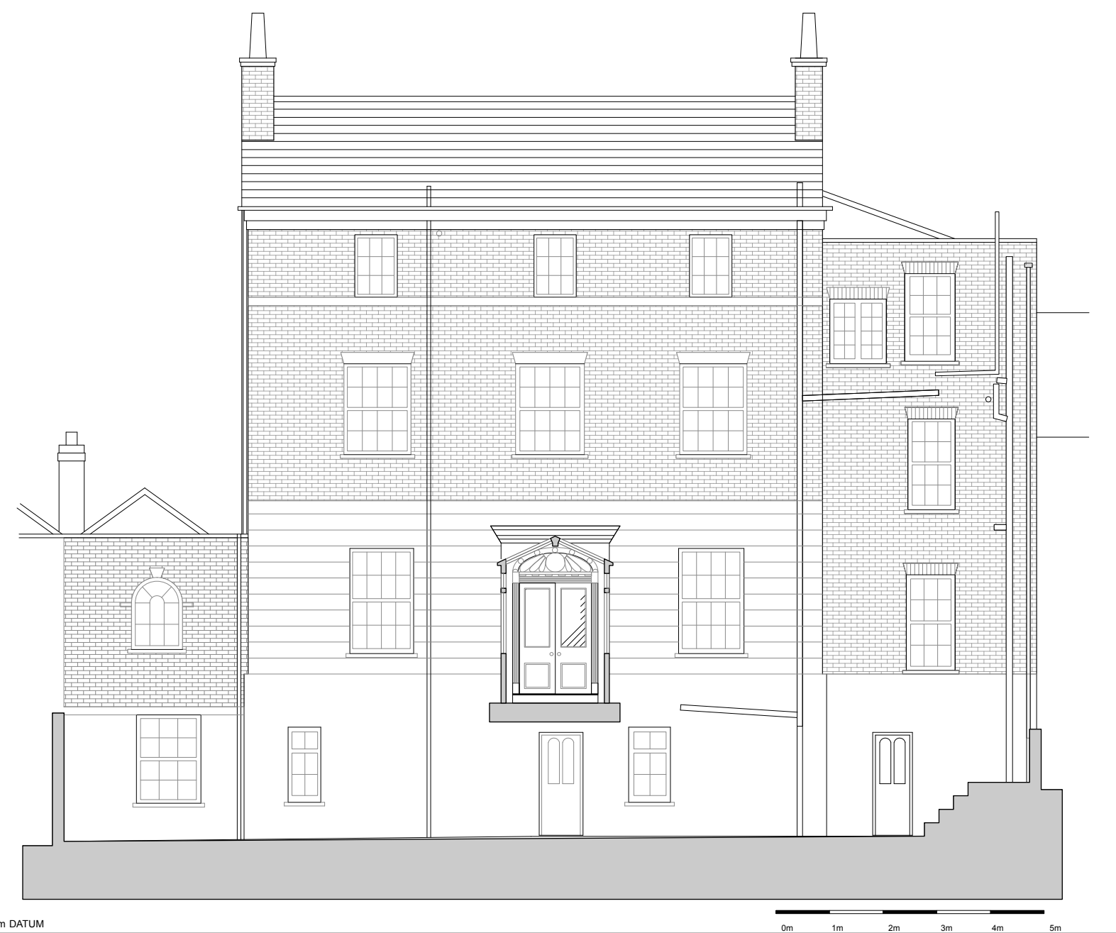
17.0m DATUM SECTION B-B