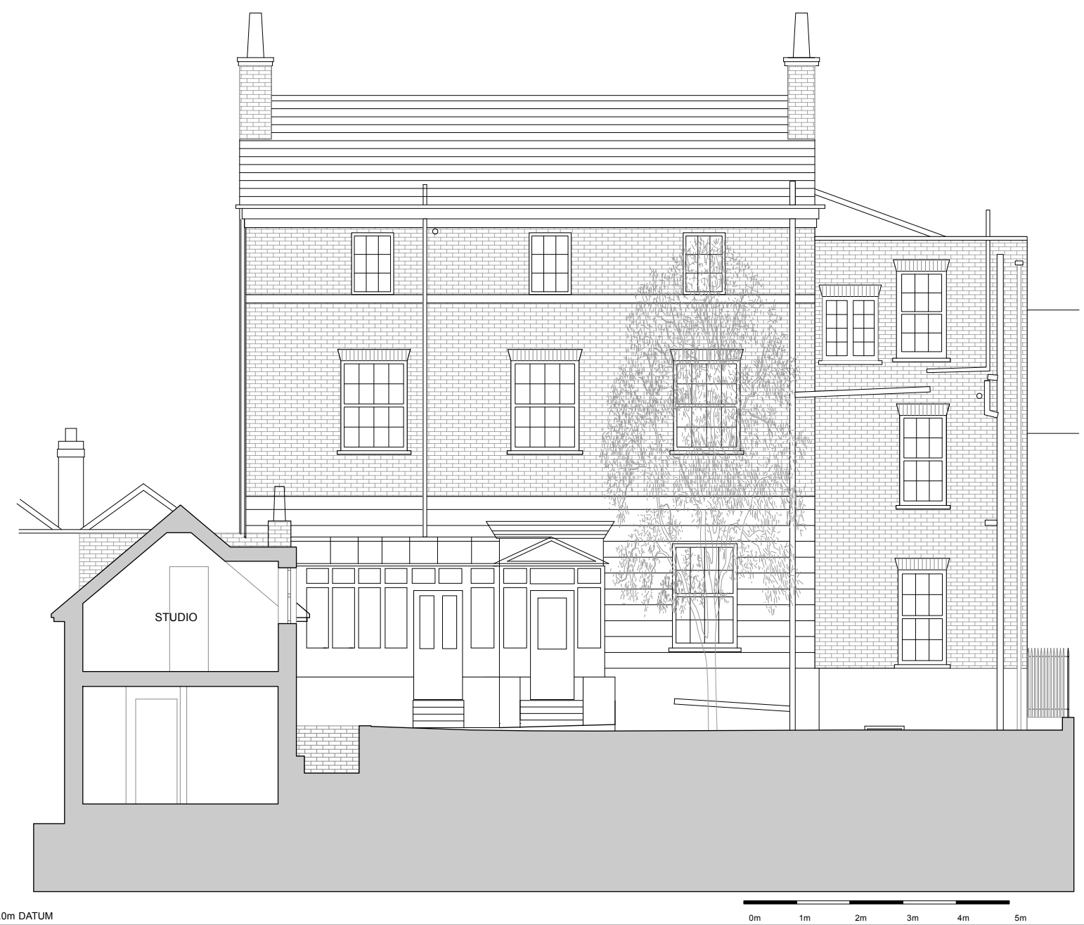
17.0m DATUM SECTION A-A