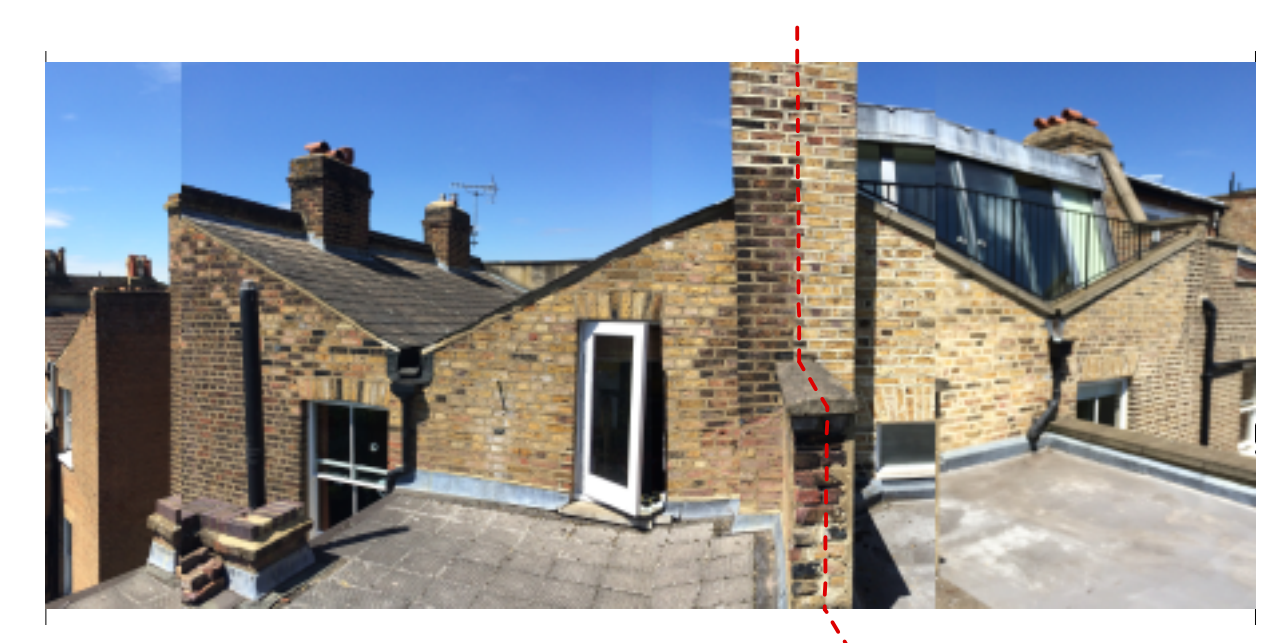
IMAGE 04 - Existing butterfly roof profile and third floor extension at neighbouring property 67 South Hill Park