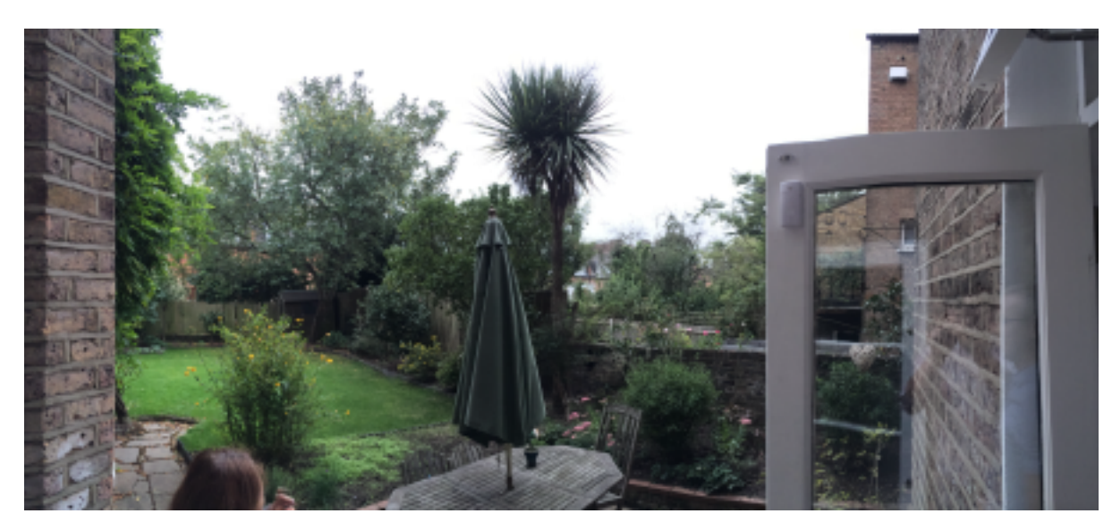
IMAGE 03 - Rear garden at 65 South Hill Park looking due South from rear