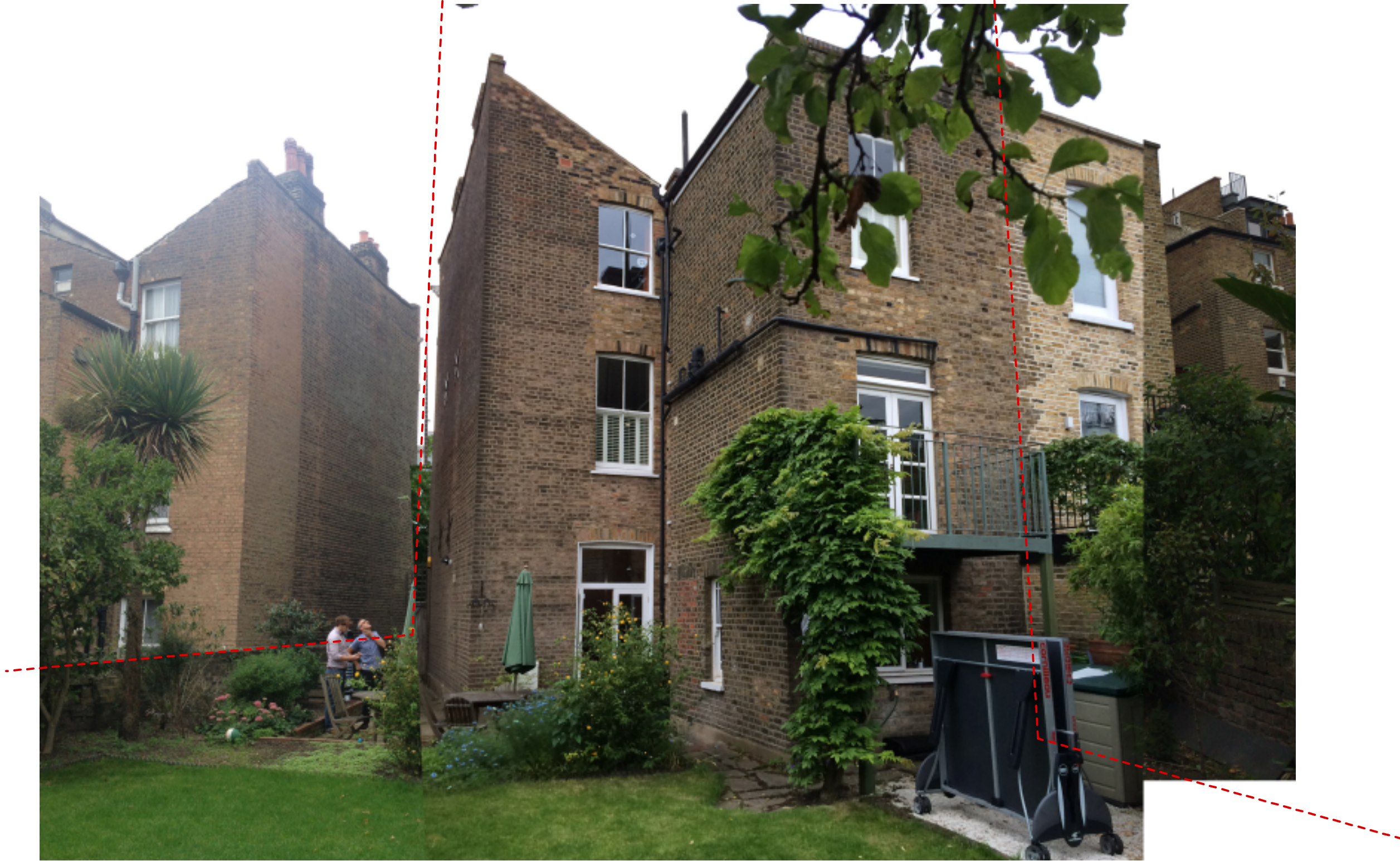
IMAGE 02 - Rear Elevation of 65 South Hill Park from private garden

67 SOUTH HILL PARK 65 SOUTH HILL PARK 63 SOUTH HILL PARK