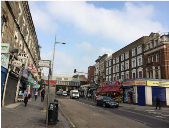
View of site along Kilburn High Road