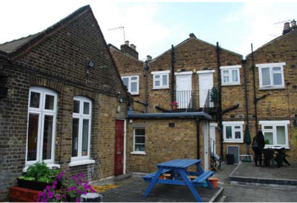
Rear View of existing flats at 2nd floor level