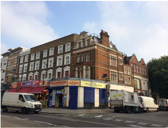
View of site at corner of Kilburn High Road and Netherwood Street