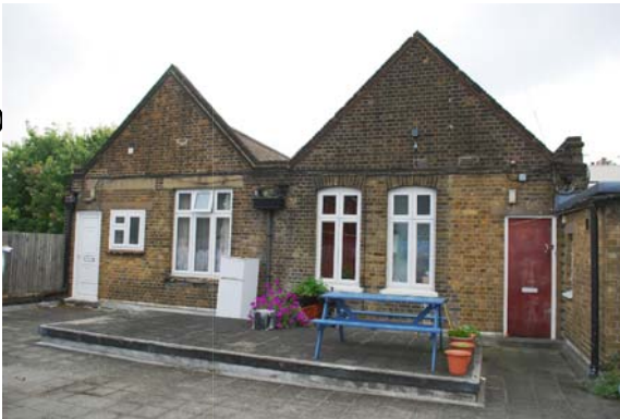
Rear View of existing flats at 2nd floor level

The use of this data by the recipient acts as an agreement of the following statements. Do not use this data if you do not agree with any of the following statements:-