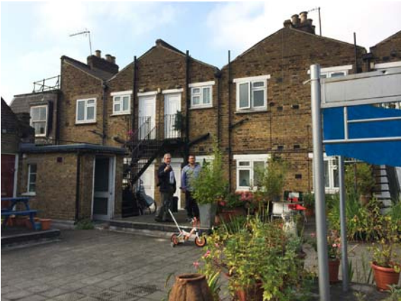
Rear View of existing flats at 2nd floor level