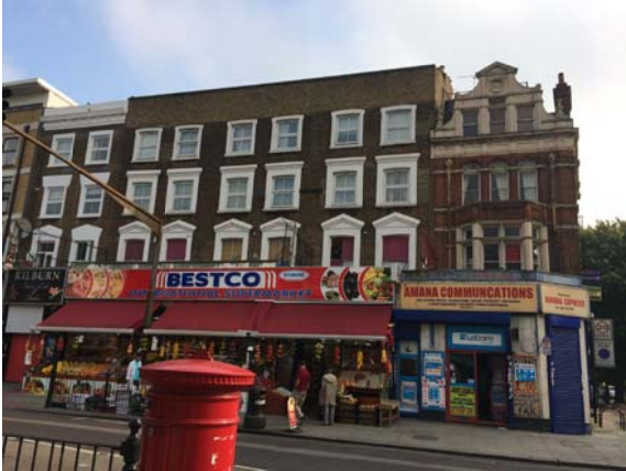
View of site from Kilburn High Road