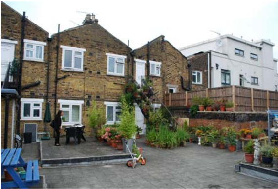
Rear View of existing flats at 2nd floor level