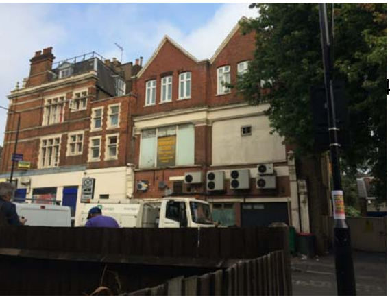
View of site from Netherwood Street