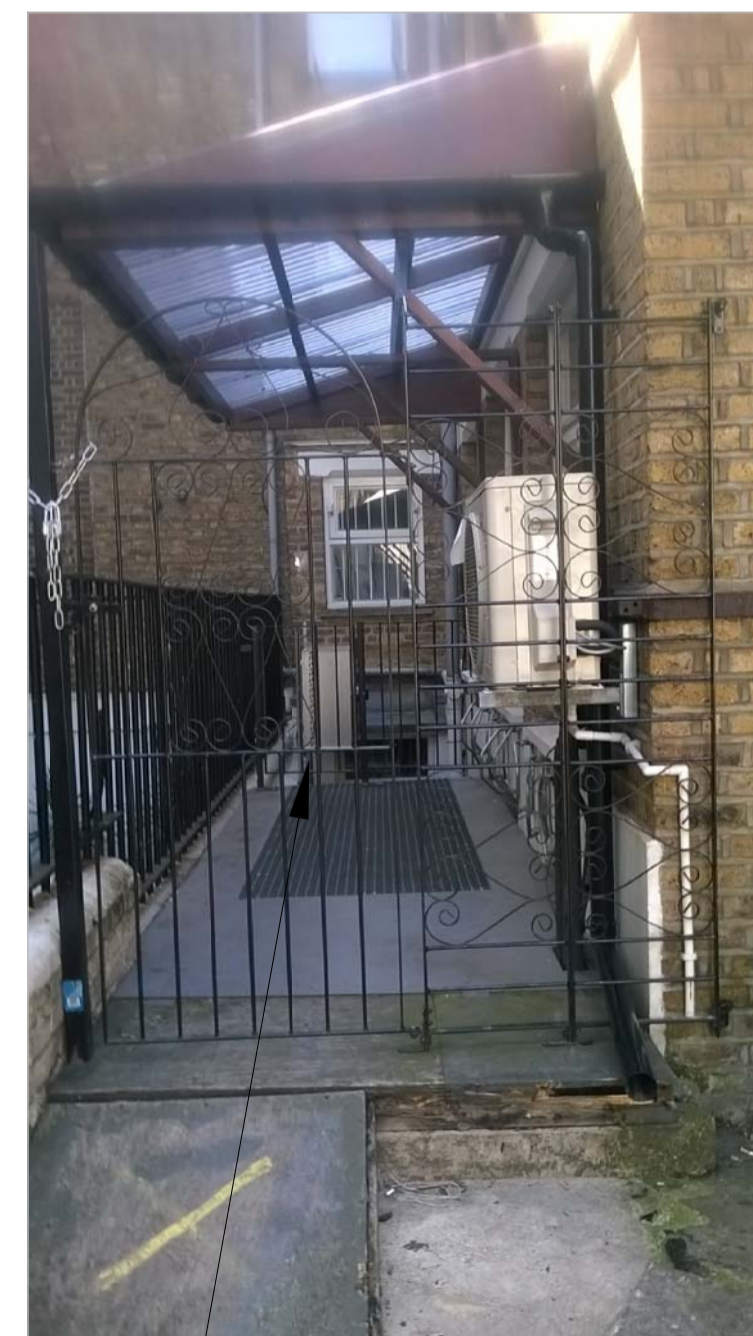
PHOTOGRAPH 1 LOCATION OF EXISTING AIR CONDITIONING CONDENSER UNIT RELOCATED ABOVE THE WALL TOP LEVEL OCT 2013, REQUIRING RETROSPECTIVE PLANNING APPROVAL.