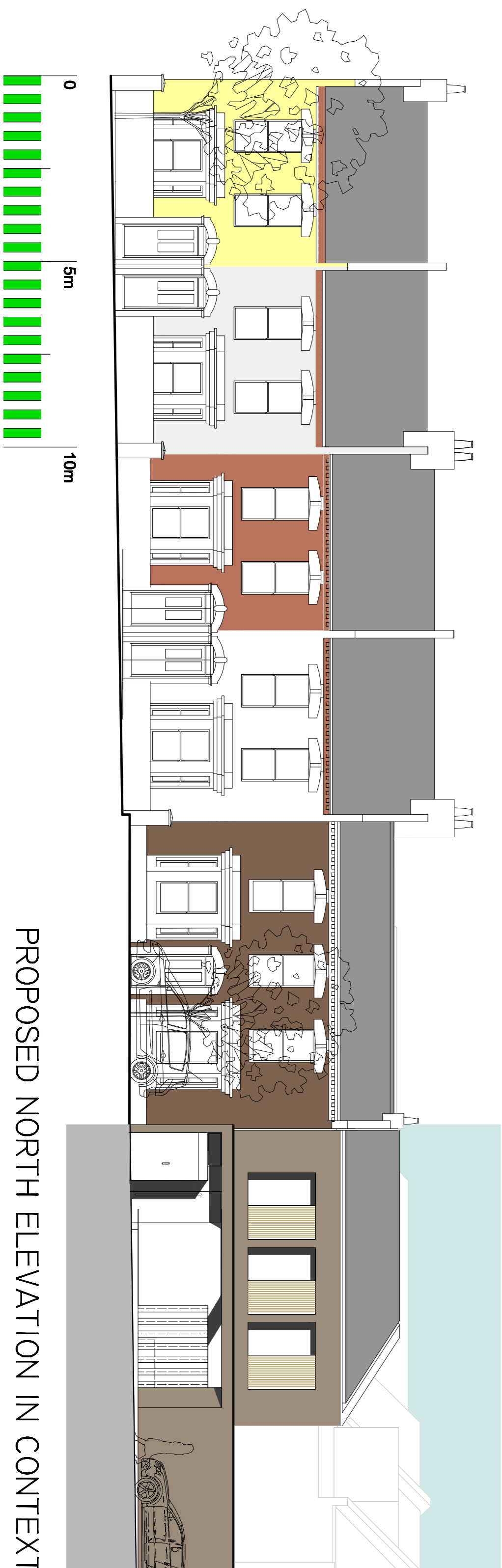
PROPOSED NORTH ELEVATION IN CONTEXT