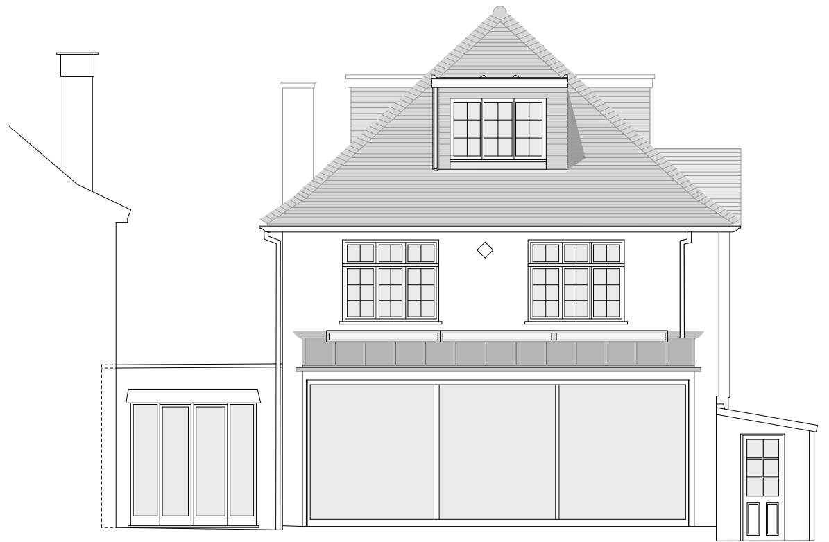
2 West Elevation