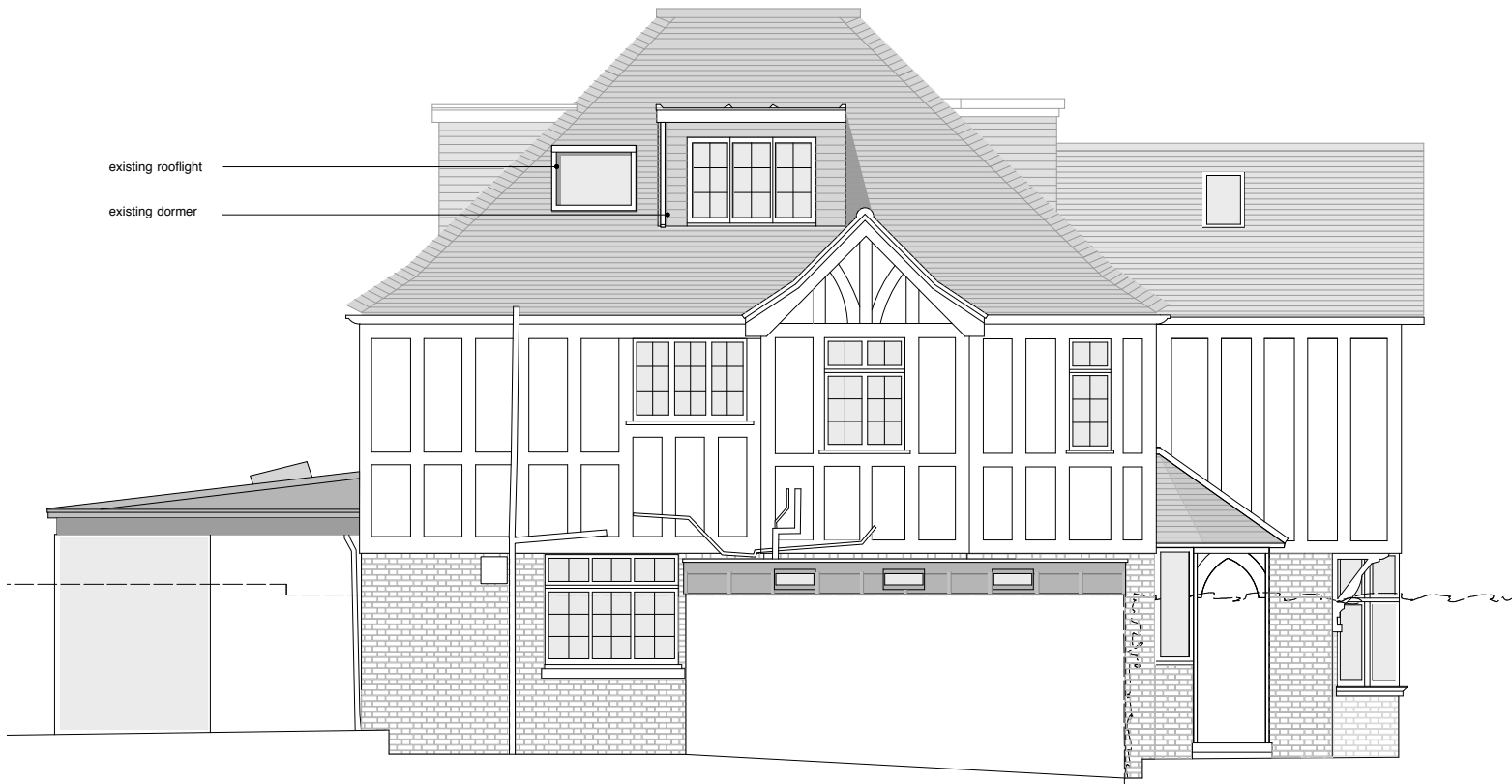
1 South Elevation