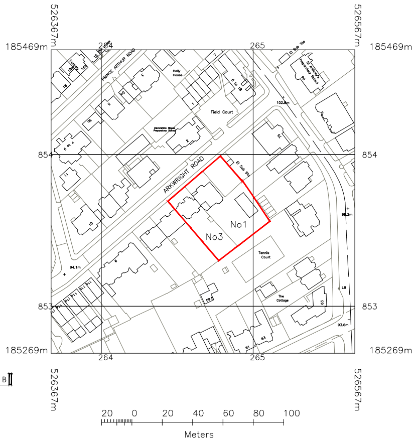
location plan 1:1250 @ A1