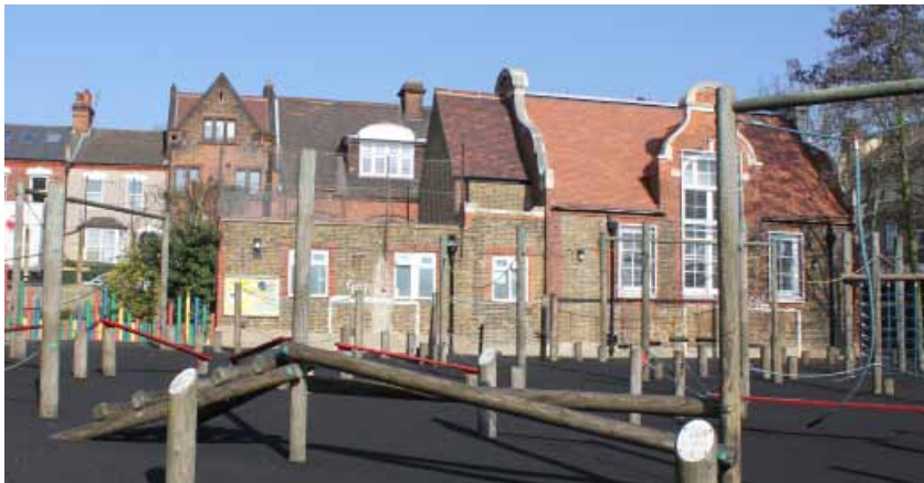
Existing Kitchen building from Playground (South) showing later addition to western end

The proposed teaching kitchen is located within the later extension to the west of the building and no changes are proposed to the existing fabric, internal or external of the original building.