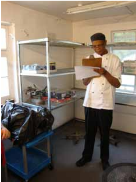
Room G42 Existing Store Room