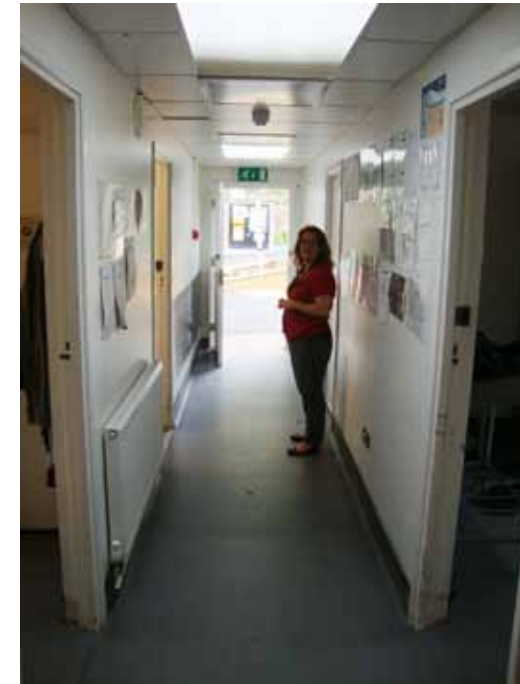
Existing corridor space