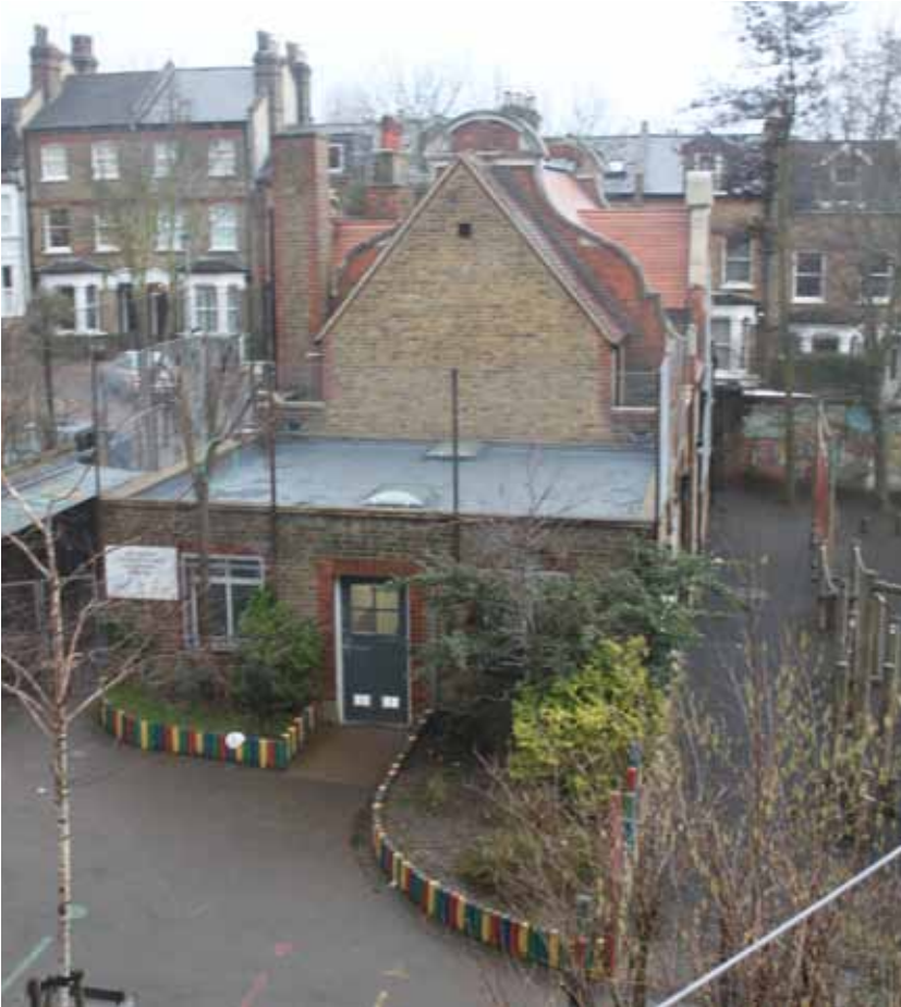
Existing Kitchen building showing later additions to western end where new teaching kitchen is proposed

Adams & Sutherland architecture landscape urban design