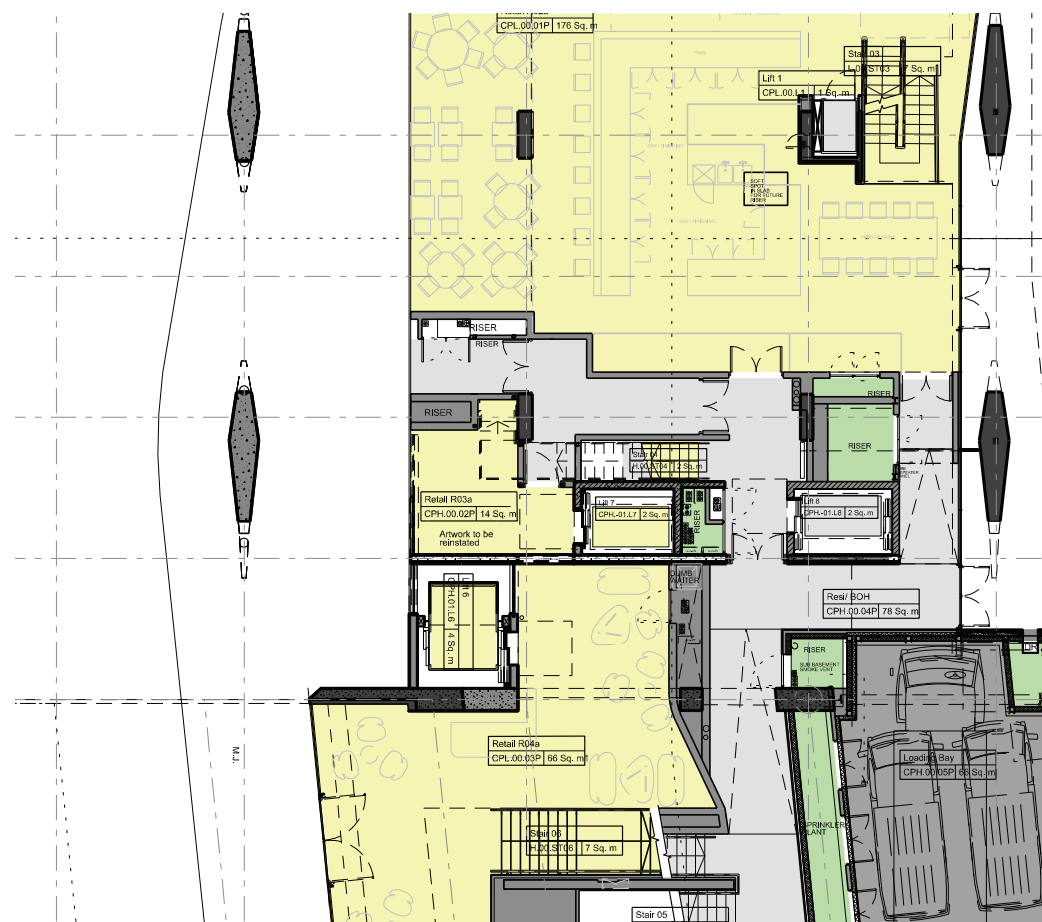
AMENDED PLAN Drawing: 19402-CPA Ground Floor Plan