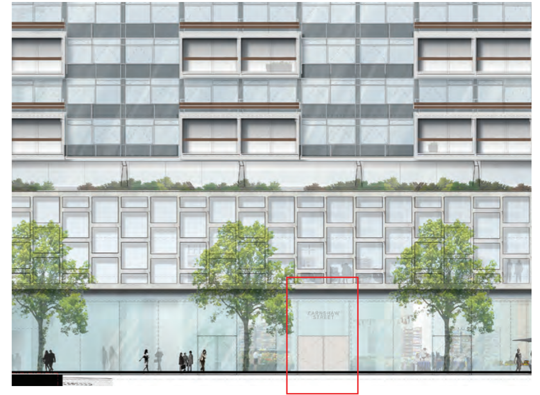
AMENDED ELEVATION Drawing: 19559-CPA West Elevation