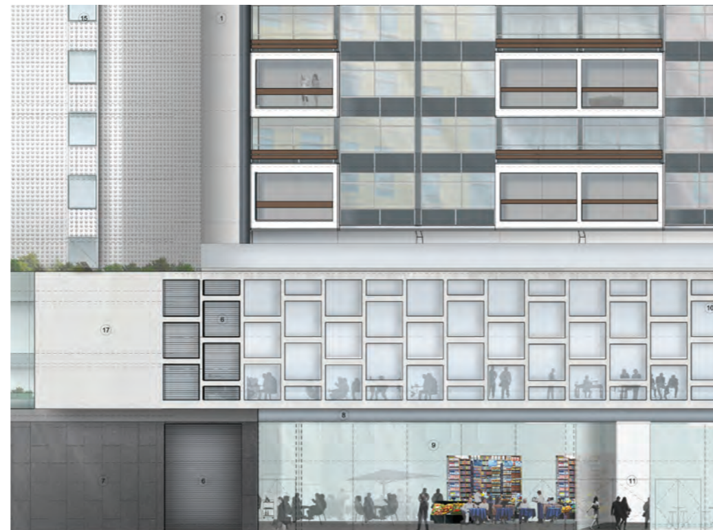
APPROVED ELEVATION Drawing: 19557-CPA East Elevation