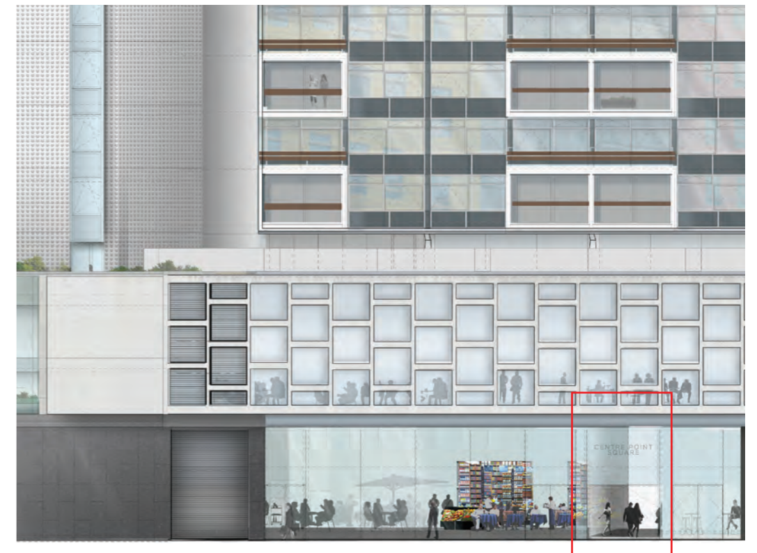
AMENDED ELEVATION Drawing: 19557-CPA East Elevation