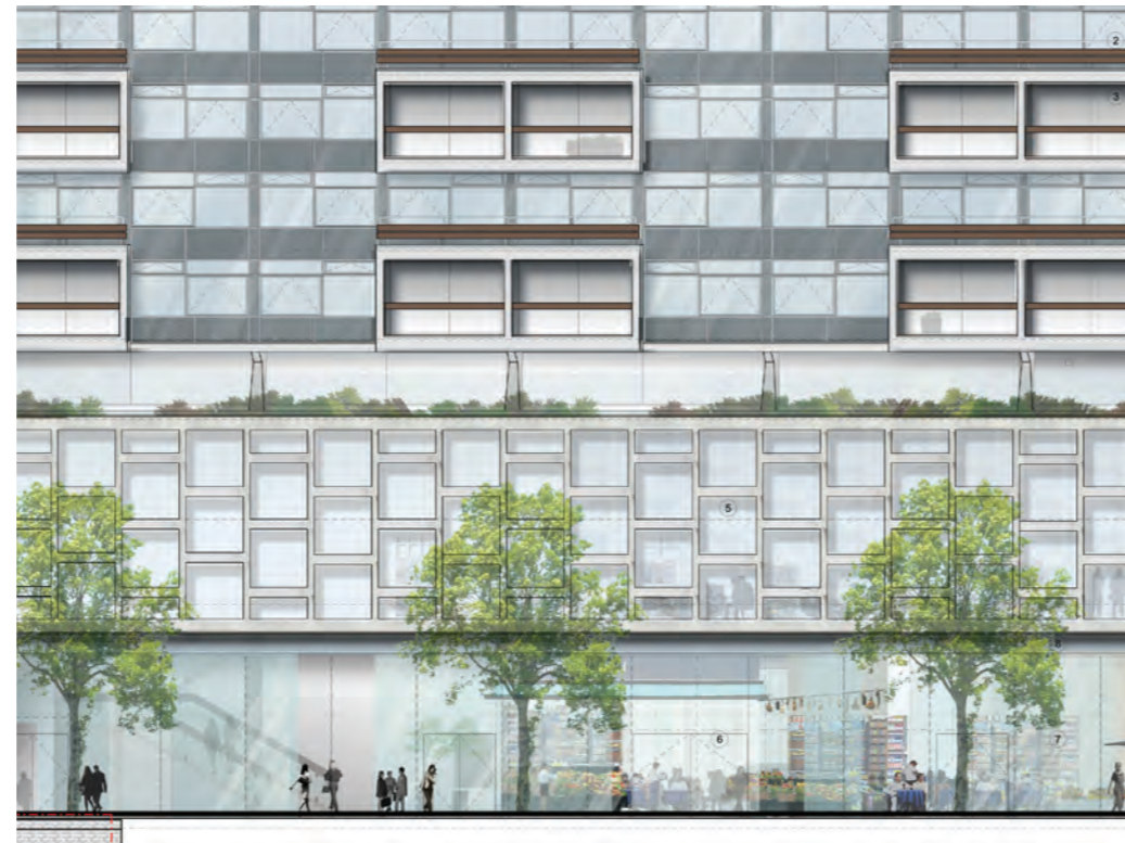
APPROVED ELEVATION Drawing: 19559-CPA West Elevation

It is therefore proposed to reduce the height of these to align with the adjacent retail door heights and provide a fixed glazed overpanel up to the underside of the soffit. This reduction in size will allow the frame to be minimised, retain the flush principle of the facade and provide a consistent visual line. It will also benefit by providing a clearer, permanent area for pedestrian signage on the static overpanel above, which is not currently provided by full height opening gates.