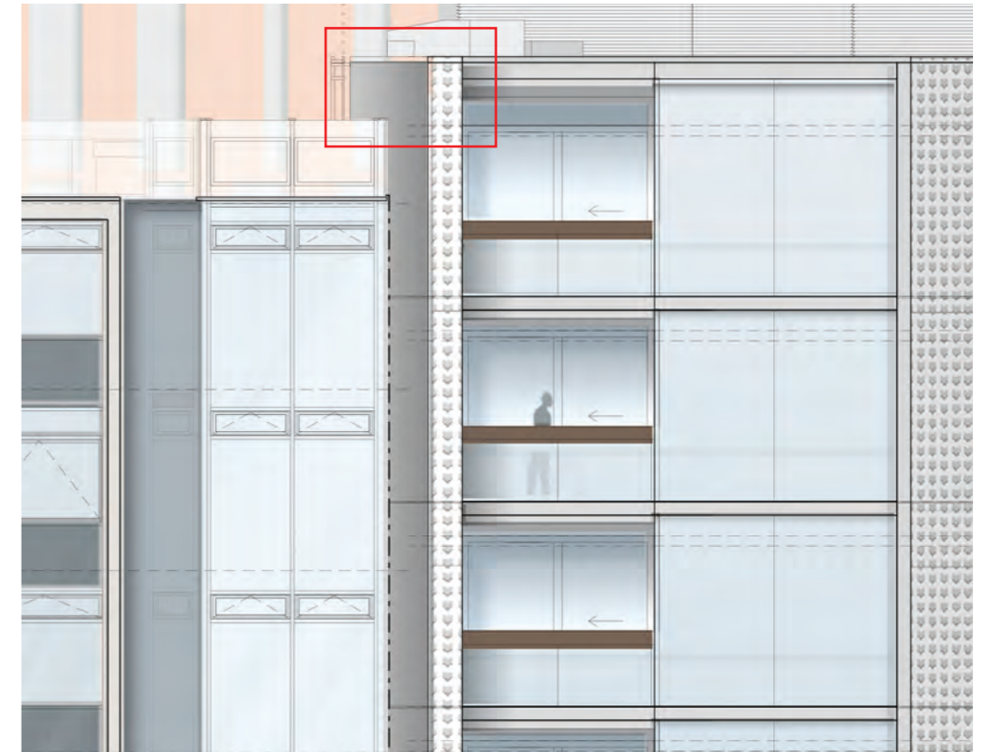
AMENDED ELEVATION Drawing: 19559-CPA West Elevation