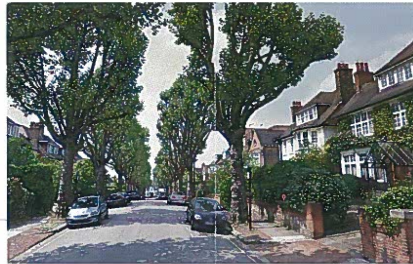
02 - STREET VIEW NORTH WEST