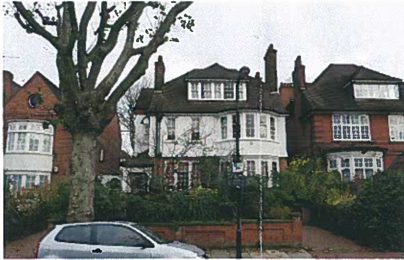
01 - STREET VIEW