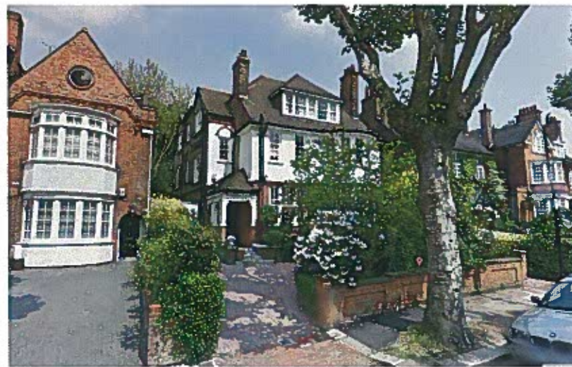
03 - STREET VIEW NORTH EAST