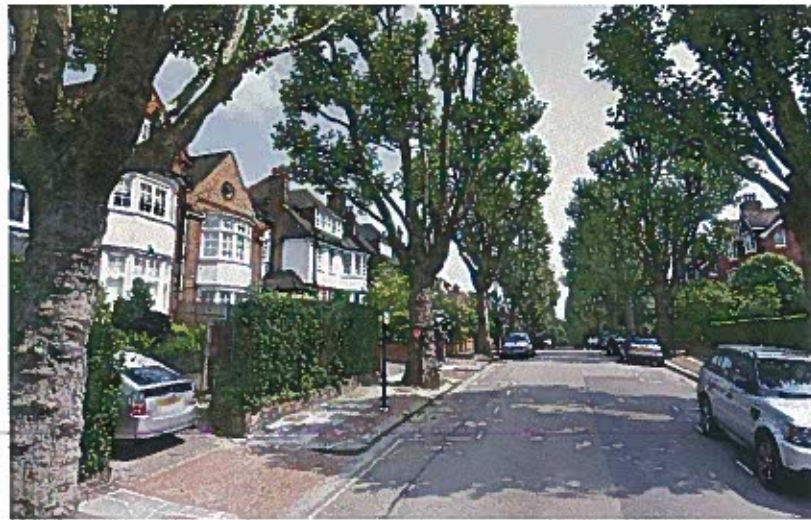
01 - STREET VIEW SOUTH EAST

Refer to the site plan below for the position of the photographs in relation to the site.