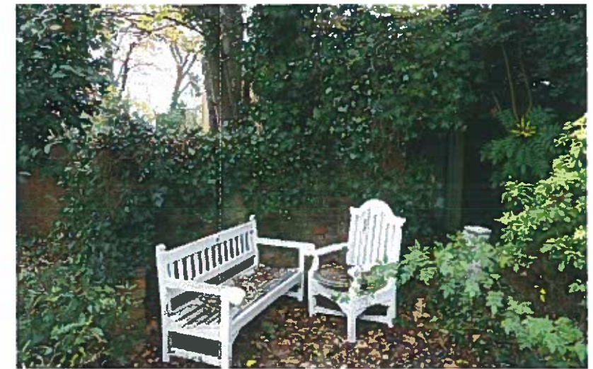
2 - REAR GARDEN VIEW