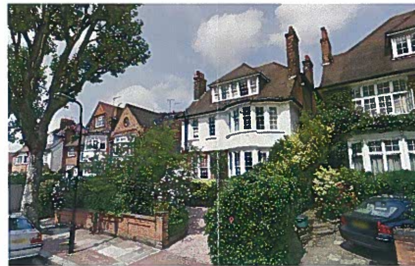
04 - STREET VIEW NORTH