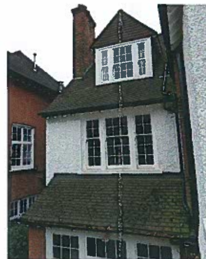
4 - REAR ELEVATION VIEW