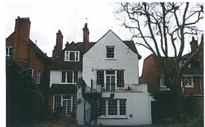
REAR ELEVATION VIEW