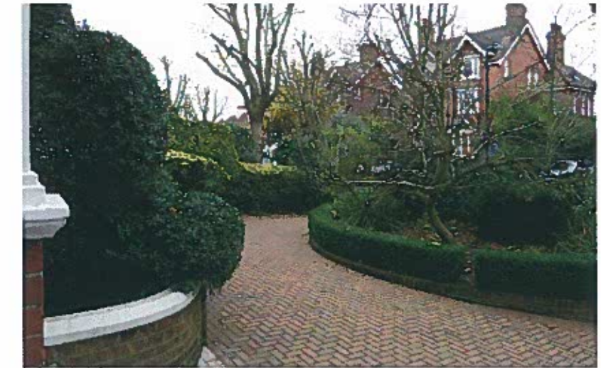
05 - FRONT GARDEN