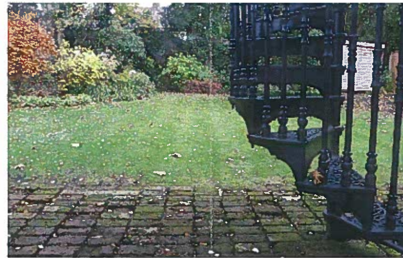
1 - REAR GARDEN VIEW