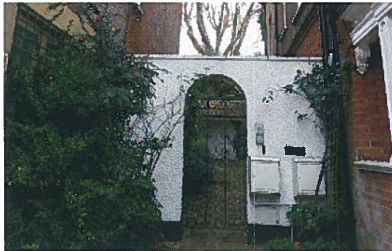
03 - SIDE GATE