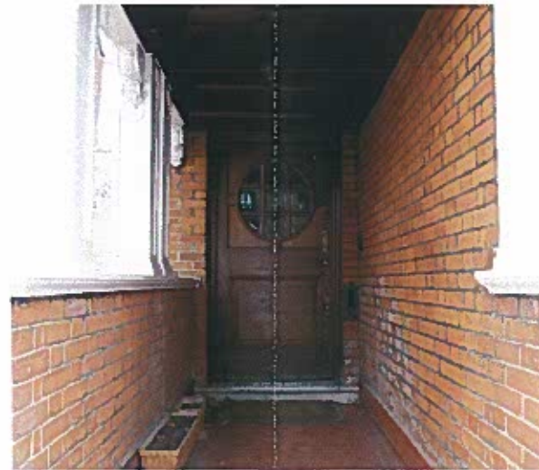
04 - FRONT DOOR