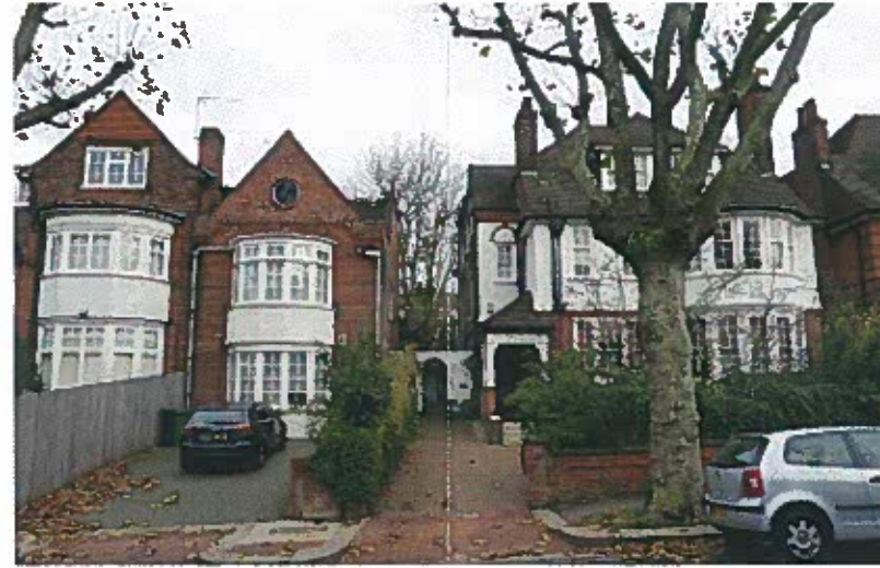
02 - STREET VIEW