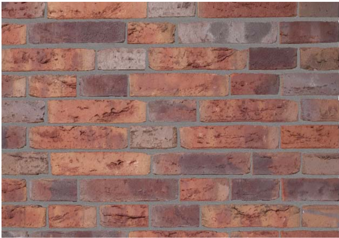
Billund 513 WS brick by Hoskins Brick Ltd with flush mortar to compliment the adjacent Interchange building