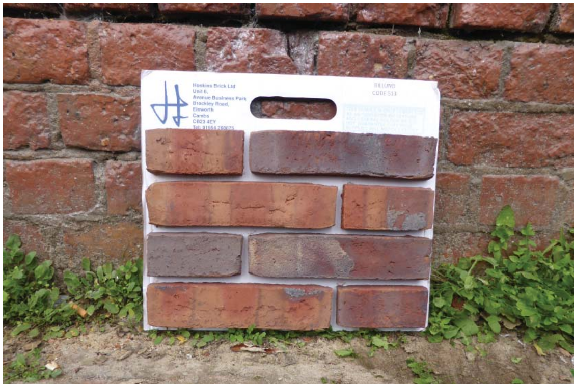
Billund brick adjacent to Interchange building

A sample of this brick will be sent to the Local Planning Authority to accompany this submission.