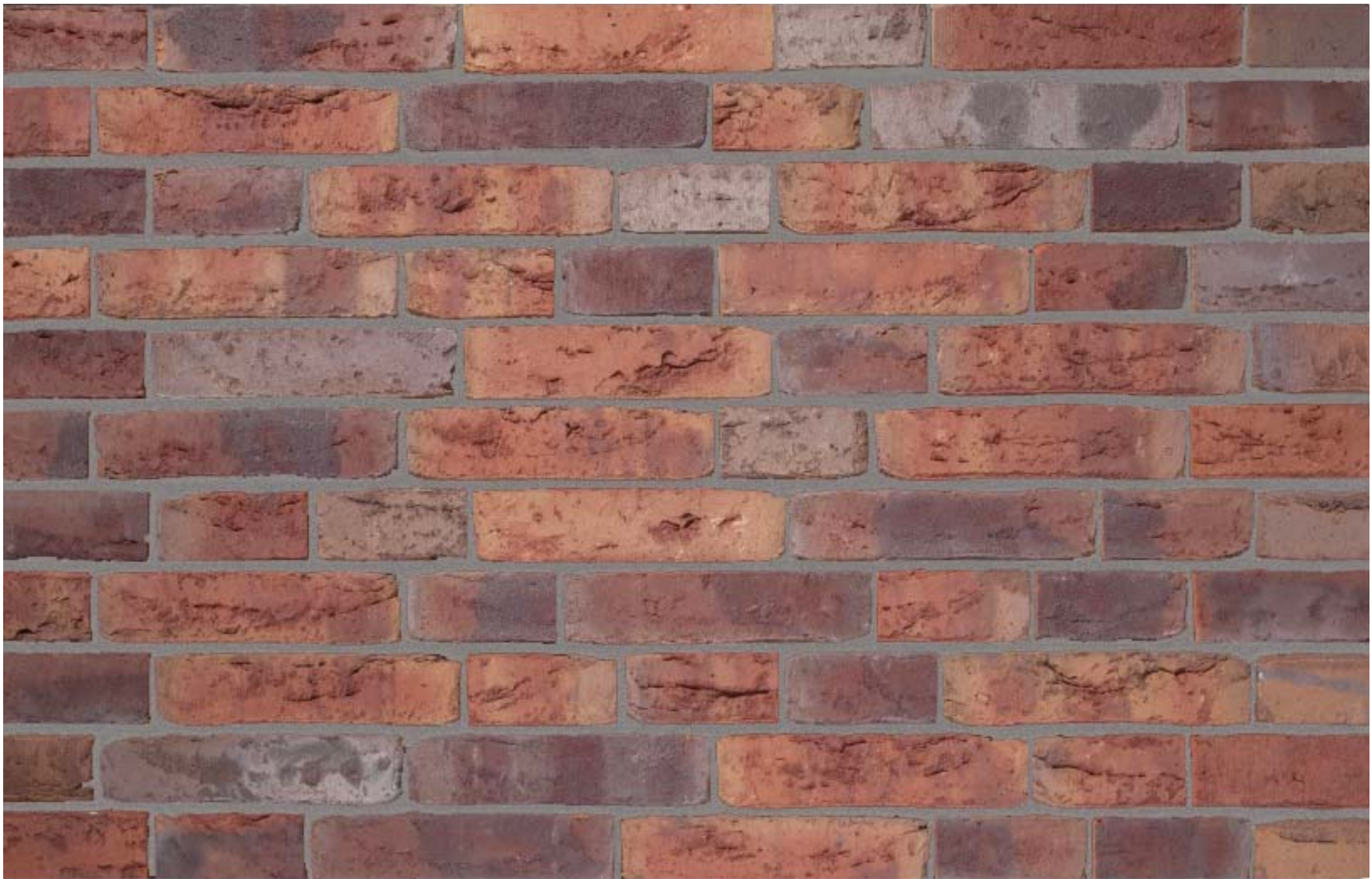
Billund 513 WS brick by Hoskins Brick Ltd with flush mortar to compliment the adjacent Interchange building

This submission concerns the facing bricks proposed for the development at 32 Jamestown Road (Application ref: 2013/8265/P) and deals with the partial discharge of the folloiwing planning conditions: