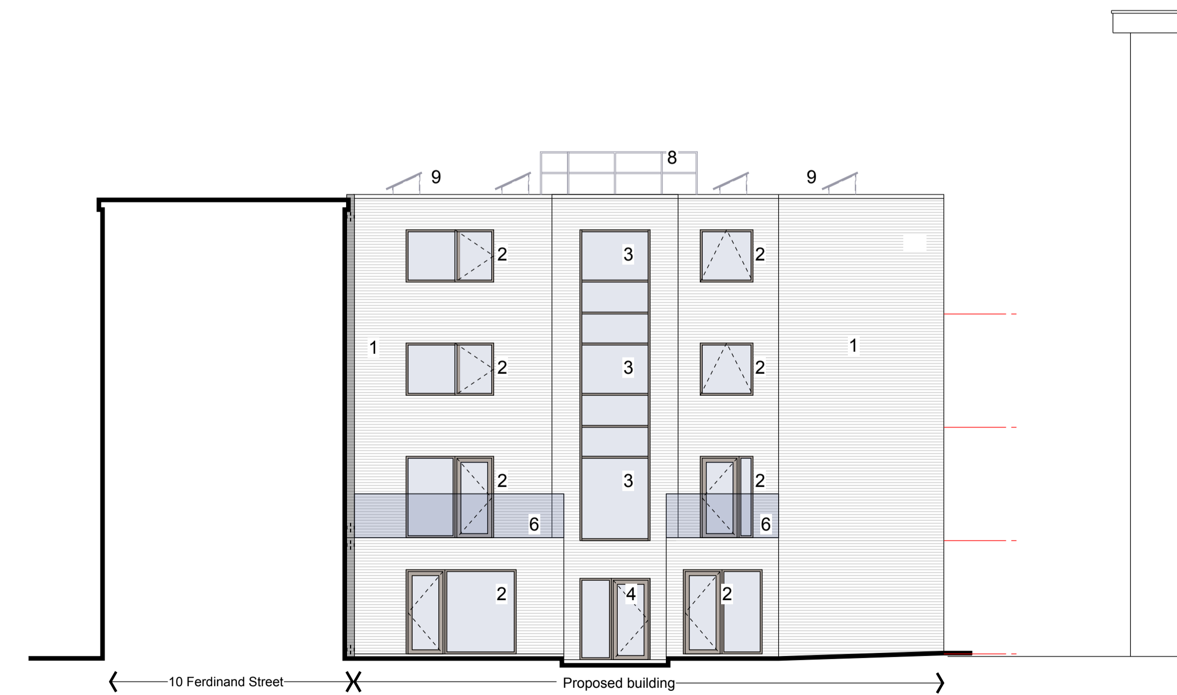
03 East Elevation Scale 1:200 @ A3