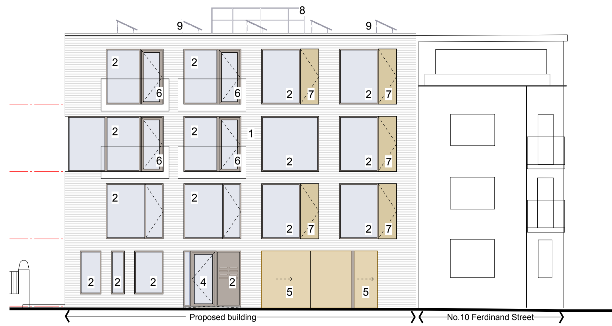
01 West Elevation, Ferdinand Street Scale 1:200 @ A3