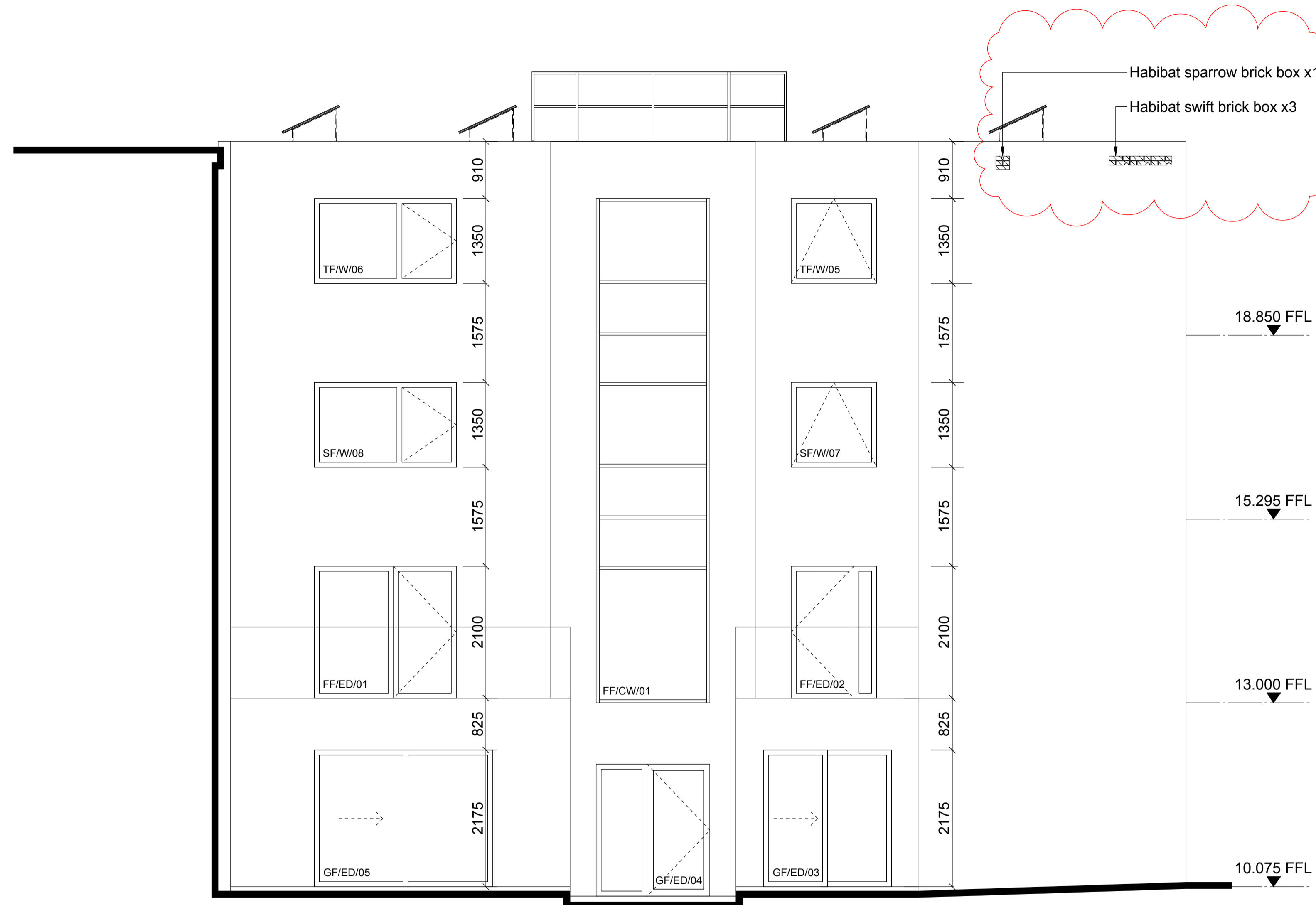
East Elevation (rear) Scale 1:100 @ A3